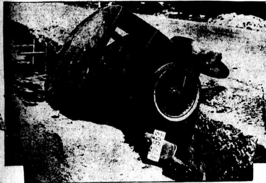
AUTOMOBILE FINDS WAY TO WATER DEPARTMENT'S EXCAVATION. The car bearing license tags No. 177953 met with disaster on Wynnefield avenue. There were six passengers in the car. None injured seriously