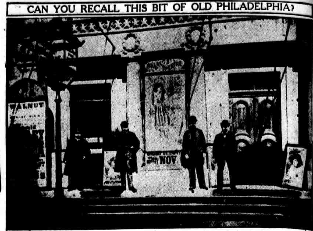
FRONT ENTRANCES OF THE WALNUT STREET THEATRE as they looked in 1880. Several of the theatre attaches are shown. If you have an old-Philadelphia photograph, please send it to the EVENING PUBLIC LEDGER