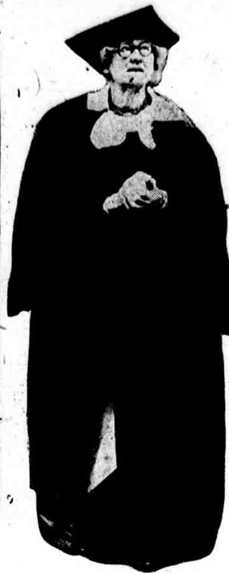
ELLEN TERRY, England's famous actress, receives honorary degree at St. Andrew's University, Scotland