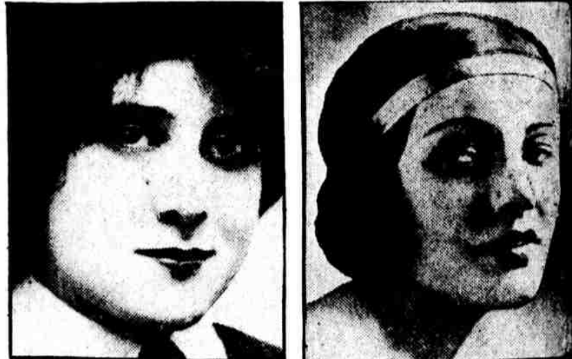
RODOLPH VALENTINO'S MARRIAGE VOID IN CALIFORNIA. The screen star married Miss Winifred Hudnut (right), on Saturday, in Mexico. His divorce from Jean Ackers (left), must be effective a year before he has right to marry, says court