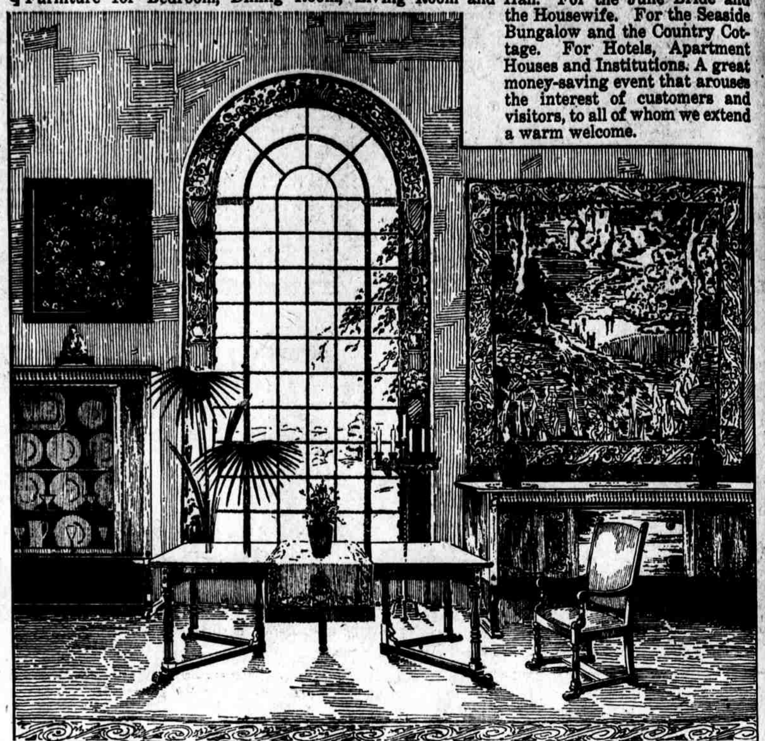
ILLUSTRATED FROM OUR SALESFLOORS A handsome Dining-Room Suite, distinctive for the ideals of the Italian Renaissance which characterizes the design throughout. It requires no stretch of the imagination to picture the charming effect of this Suite in many of the modernly constructed Dining Rooms. Note the richly embellished fronts on Buffet and China Closets, and the fine fabric on Chair Seats and Chair Backs. One of many great values that adorn our salesfloors.

The most important thing to us in the Furniture business at this time is FLOOR SPACE. We are handicapped at every turn for lack of room. The new seven-story, four-acre building now going up as an addition to this great plant is occupying exactly seven separate structures, which we had to demolish to make room for it. It means we have suddenly lost the use of all this working space. Actually we are in the greatest jam in years—on our Sales Floors, in our Shipping and Receiving Departments and in our great Storage Warehouses. More space is the only solution. To make room we have got to move the Furniture, and to move the Furniture we have marked down prices right and left. Marked them at a lower margin over cost than ever before. Lower prices than any competition we know of can come down to—with the Furniture itself, and the price tags, as the best evidence of the incomparable savings. Furniture for Bedroom, Dining Room, Living Room and Hall. For the June Bride and the Housewife. For the Seaside Bungalow and the Country Cottage. For Hotels, Apartment Houses and Institutions. A great money-saving event that arouses the interest of customers and visitors, to all of whom we extend a warm welcome.