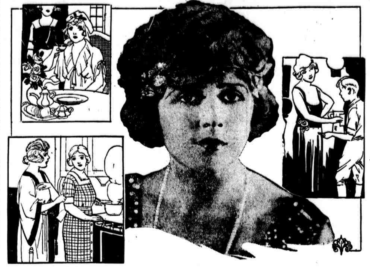
Some beauties can do this without taking much thought; but alas, there are others who cease to be beauties if they eat too much

pate de foie gras and lobster a la New-burg and rich and juicy sauces and the most beautiful woman in the world. If you are, you have to weigh and consider so that you will weigh no more a fruit salad. French dressing with a