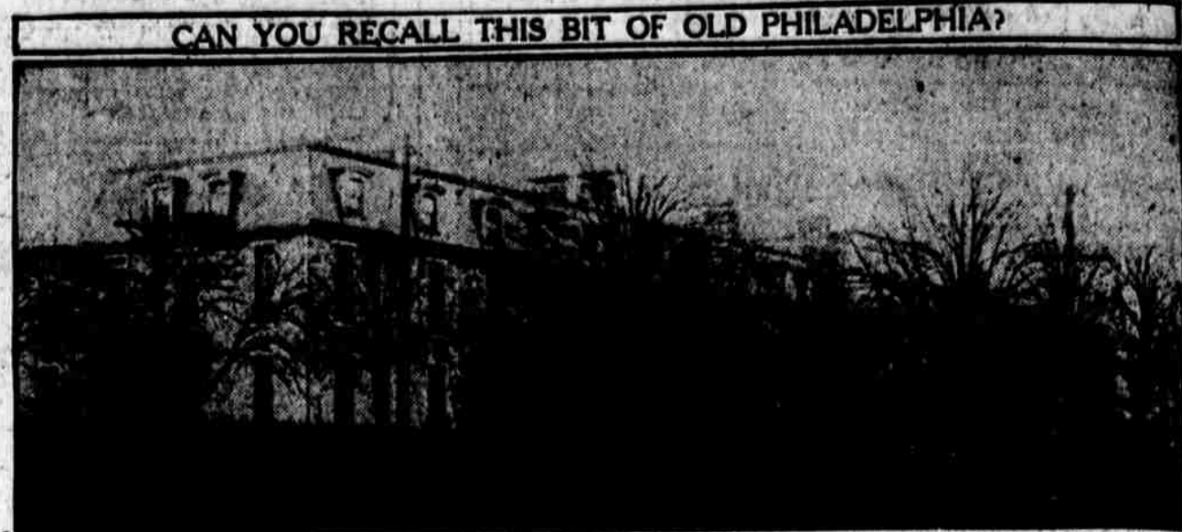
CAN YOU RECALL THIS BIT OF OLD PHILADELPHIA?