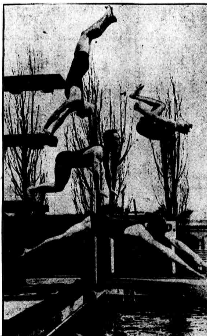
FOUR AT ONCE. Four British divers were caught in the air as the swimming season at Chiswick, England, was opened. There sure is a lot of action