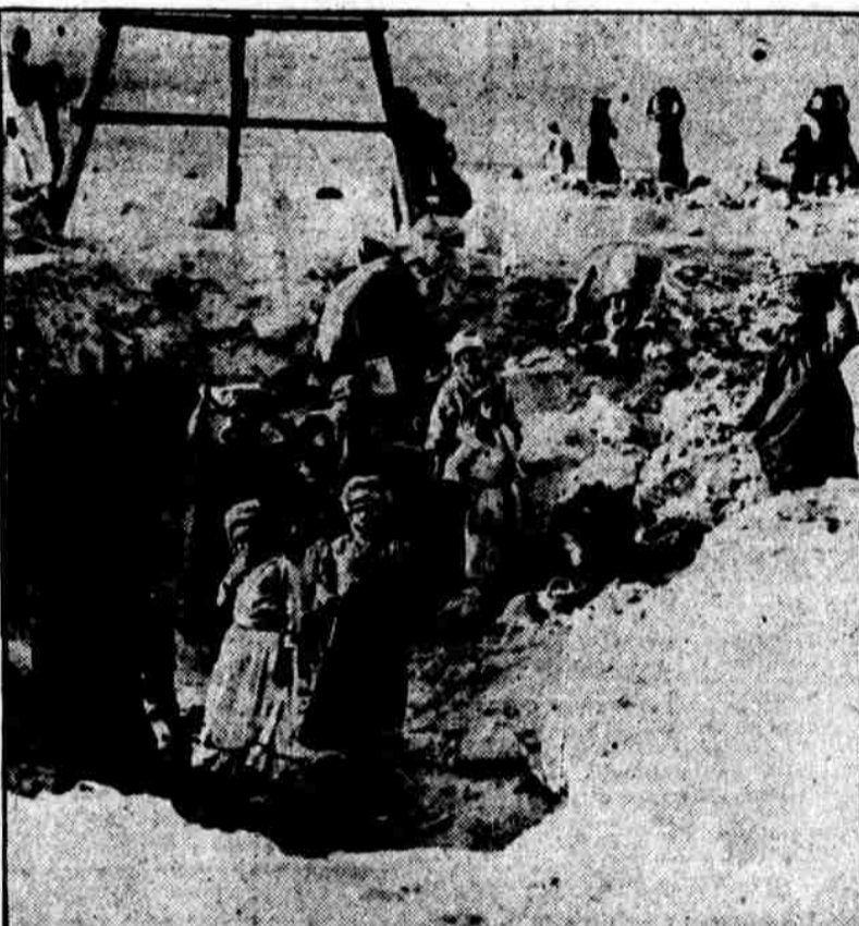
THEY'RE WORKING FOR PENN. Arab workmen busy at Tell El-Huen, near Beisan, in Palestine, excavating under the direction of U. of P. archeologists