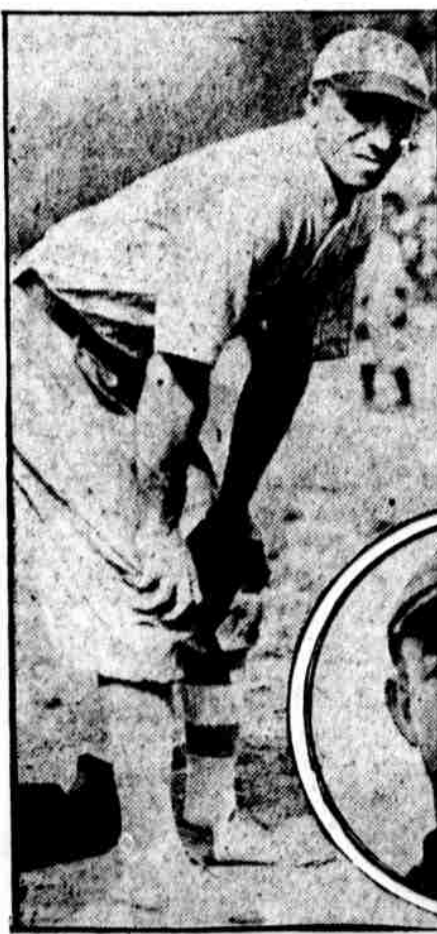
ON A NEW JERSEY BASEBALL BATTLEGROUND. These Jersey rooters saw an eleven-inning contest, won by Audubon from the Brooklawn speed-