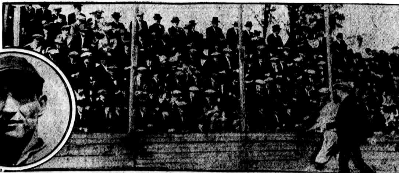
ON A NEW JERSEY BASEBALL BATTLEGROUND. These Jersey rooters saw an eleven-inning contest, won by Audubon from the Brooklawn speed-