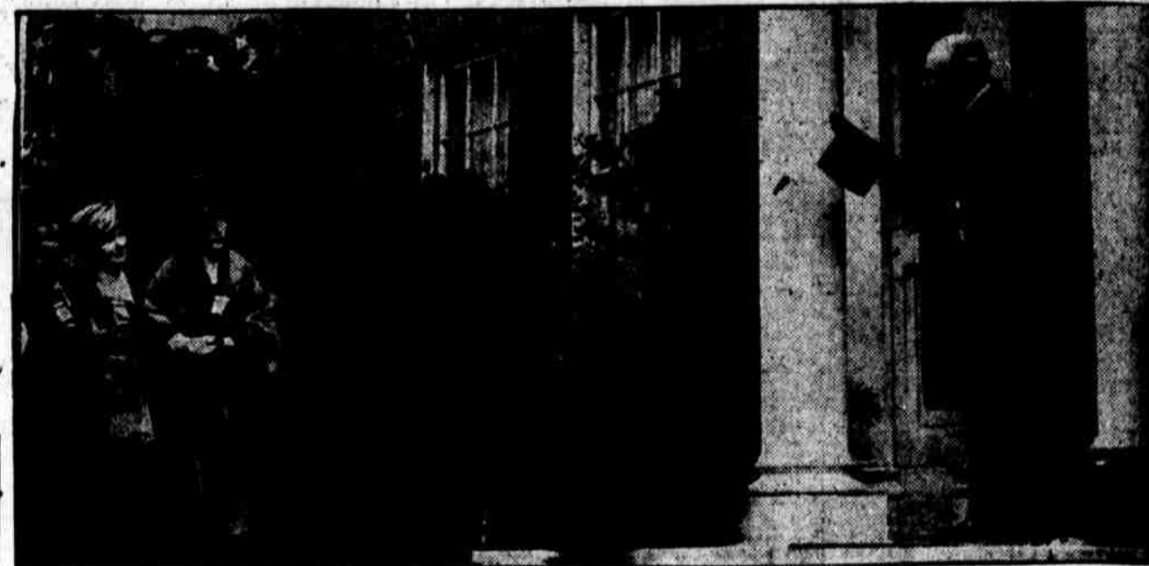
FORMER PRESIDENT WILSON RECEIVED DELEGATION. He is shown as he stood in front of his home, 2340 S street, Washington, when delegates to the Pan-American Women's Conference, League of American Pen Women and the National League of Women Voters called on him