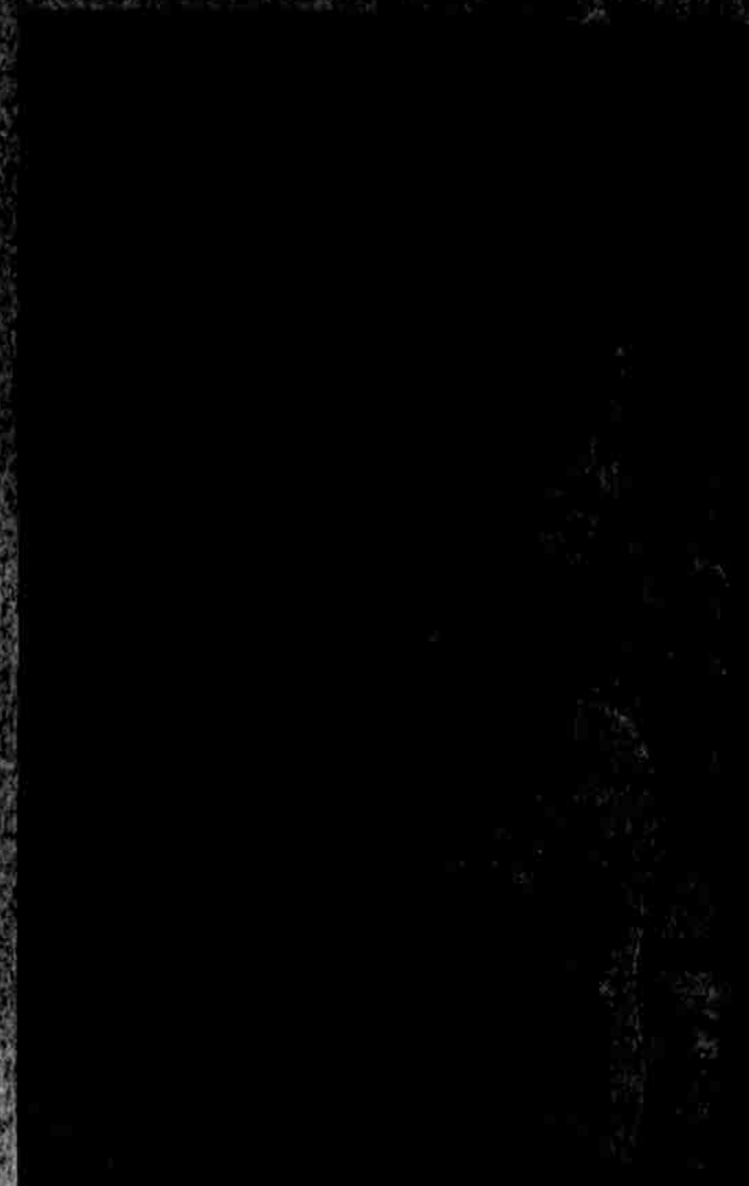
A BUREY MOMENT. This section of the huge crowd of the Penn relays paid strict attention to the fast race put on by the parochial school athletes