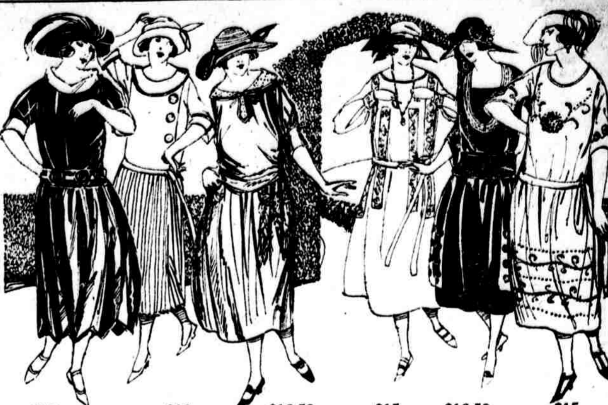
$15 $10 $16.50 $15 $16.50 $15

Of good white organdie with ruffles trimming the Peter Pan collar and the cuffs of the short sleeves.