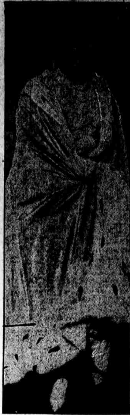
ELSIE FERGUSON, the actress, was a guest of the Charlotte Cushman Club at its benefit yesterday