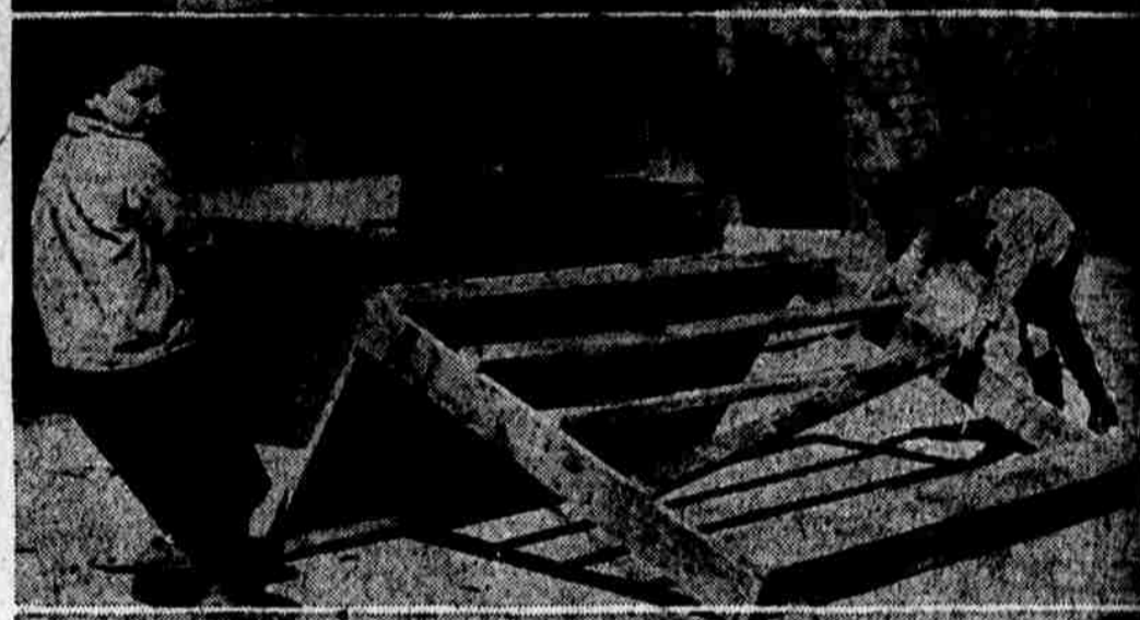
READY FOR CHILLY MORNINGS. Two South Philadelphia boys find some excellent new firewood. They immediately go into action to get it into the cellar of the boy at the left