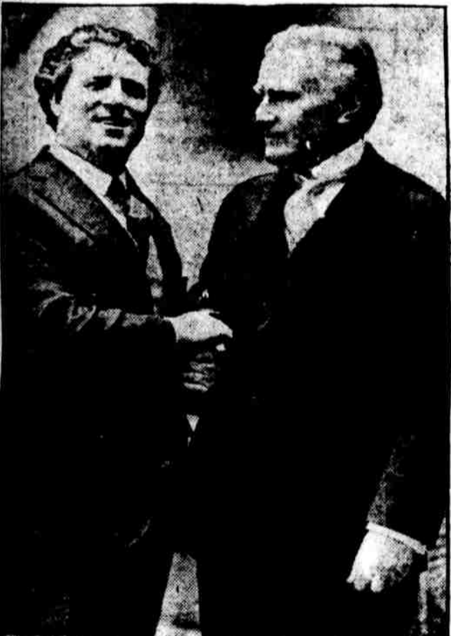
AMONG THOSE PRESENT. Giovanni Martinelli (left) and Walter Damrosch were guests at the "white breakfast" given by the State Federation of Musical Clubs.