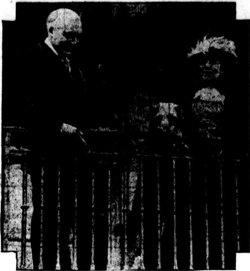
THE WHITE HOUSE "RECEPTION COMMITTEE." Laddie Boy is always at hand when President and Mrs. Harding have an engagement to entertain visitors in small or large groups at the White House.