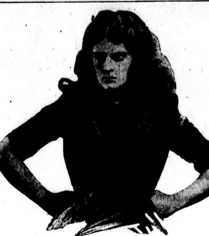
PRISCILLA DEAN In costume for "That Lass O'Lowries"

We will be glad to publish the pictures of such screen players as are suggested by the fans