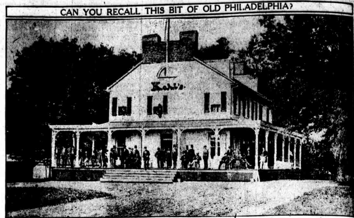
CAN YOU RECALL THIS BIT OF OLD PHILADELPHIA?