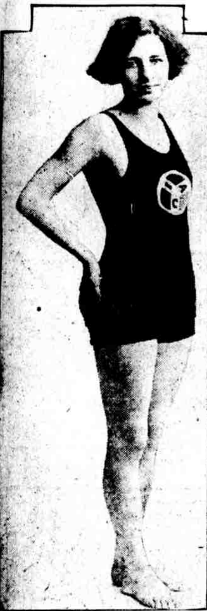
MISS SYBIL BAUER, of Chicago, holder of many records for back-stroke swimming