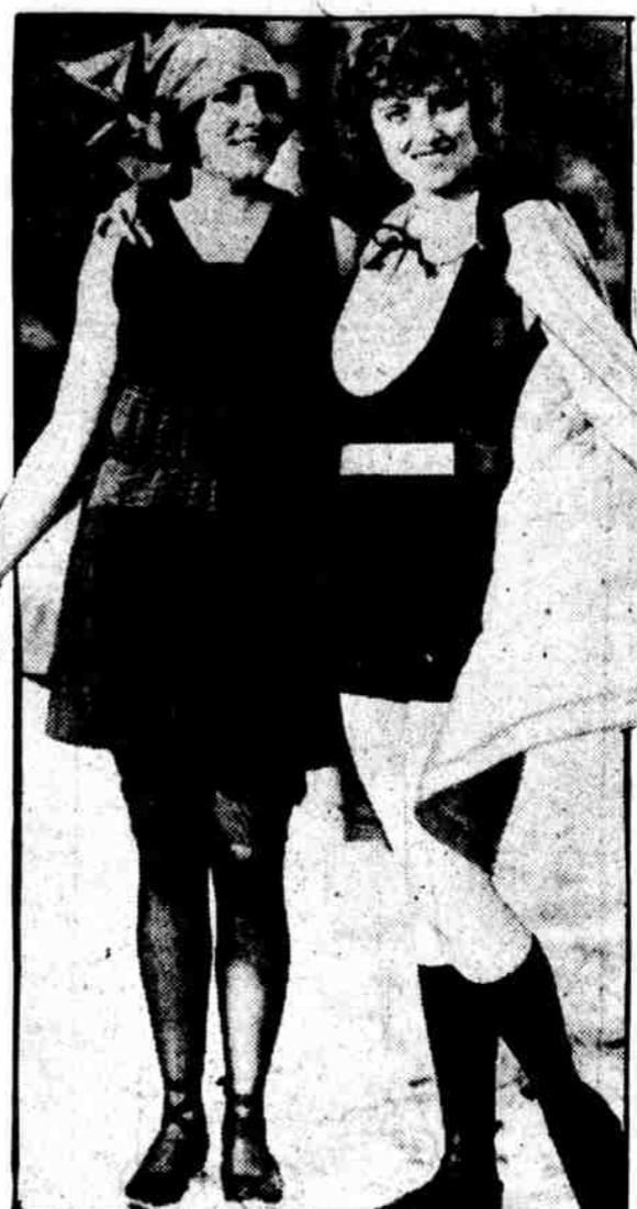
THEY'LL BE WORN THIS SUMMER. Two types of bathing suits found at Atlantic City's fashion show