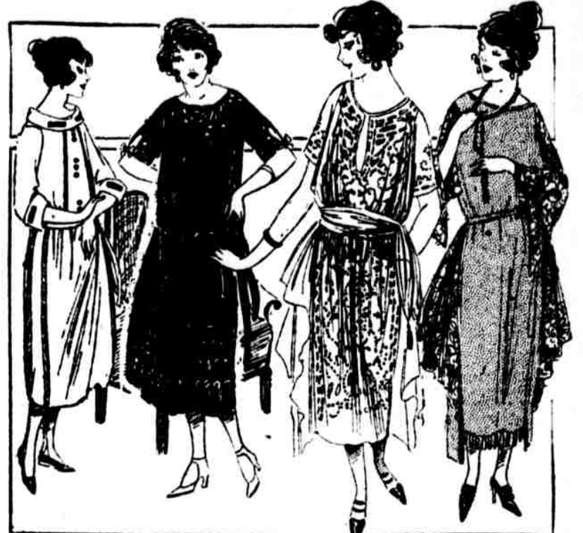
$5 $10 $20 $20

Some of the frocks are in sleeveless slip-on style, others have long sleeves and linen collars and cuffs. Others are fringed. In orchid, rose, Copenhagen and tan.