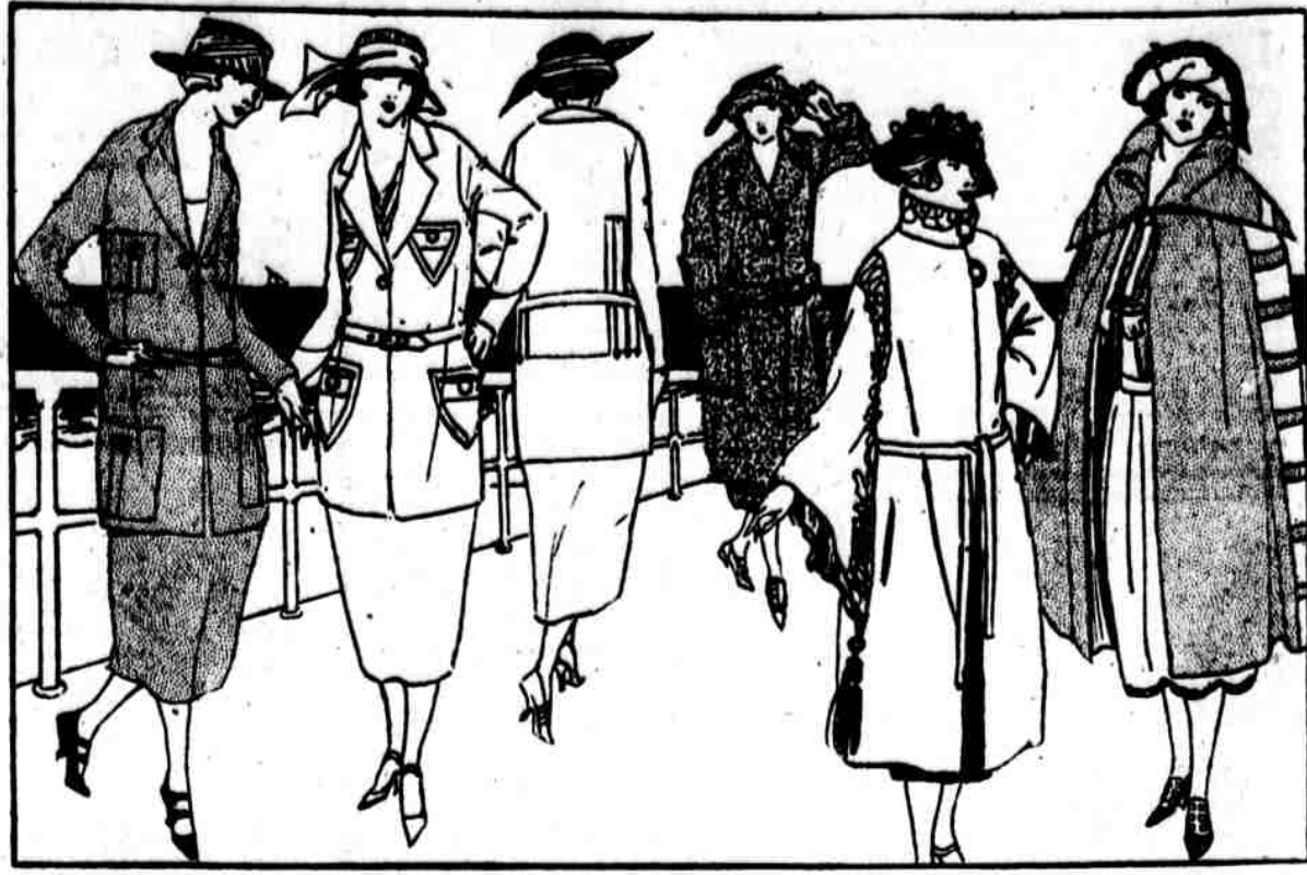
$16.50 $16.50 $20 $15 $25 $20

Qualities Are Soundly Good and Prices Honestly Low