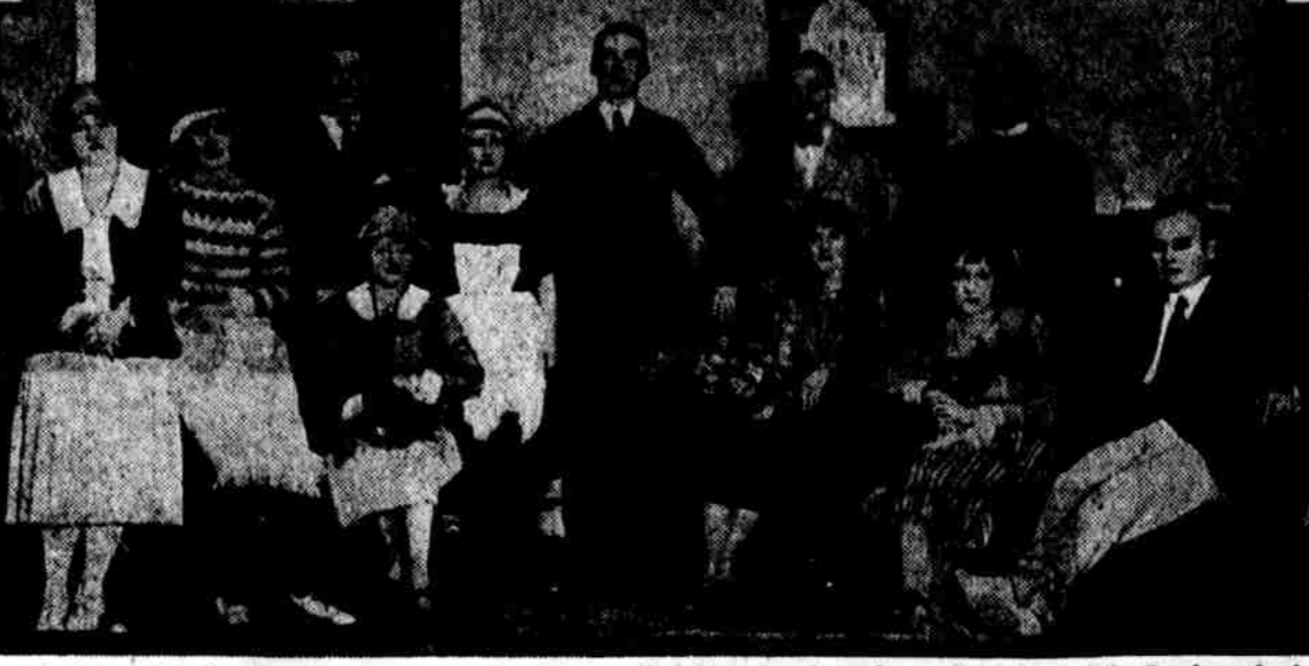
"Nothing But the Truth" was presented with a well-balanced cast, made up of members of the Sunday school of the Ashbourne Presbyterian Church. The show is given in aid of the equipment fund of the Sunday school