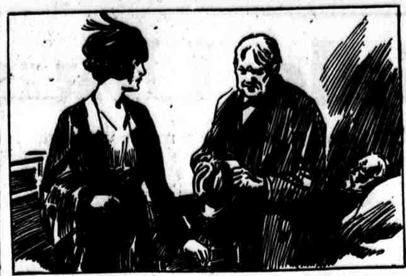
"Ain't there nothing in all the world that any of us can do to make you

An easier trick is to lay the spoon with the bowl bottom up and lift it with the finger on the bottom of the bowl. Comment, 1922, by Public Ledger Comment