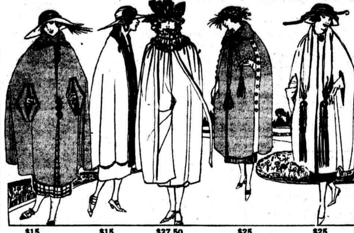
$15 $15 $27.50 $25 $25

Gingham in Pretty Checks, 22c Yard Red, pink and blue in small, medium and large checks. Lavender-and-white, black-and-white, green-and-white and broken checks in two and three color combinations that are very fresh and clear. 32 inches—a width that cuts most advantageously. Silk Vanity Cases, $3 Made of moire or satin-stripe taffeta silk with flaps finished with metal corners or small metal clips. They combine one's handbag and vanity case and are both smart and practical. Square or envelope shape—some with rounded corners. Silk cord handles. Reversible Cotton Rugs, $1.50 More of these well-liked rugs that women will want for Summer cottages or in place of the heavier Winter rugs. Made of soft, firm cotton yarn with all-around borders that are a pleasing contrast. Rose, gray, green, brown and lavender—all with fringed ends. Size 2x4 feet—usually large for such a small price! Toilet Water Half the Regular Price at 25c A favorite brand of a well-known maker. Put up in decorative ounce bottles and attractively boxed in bright red.