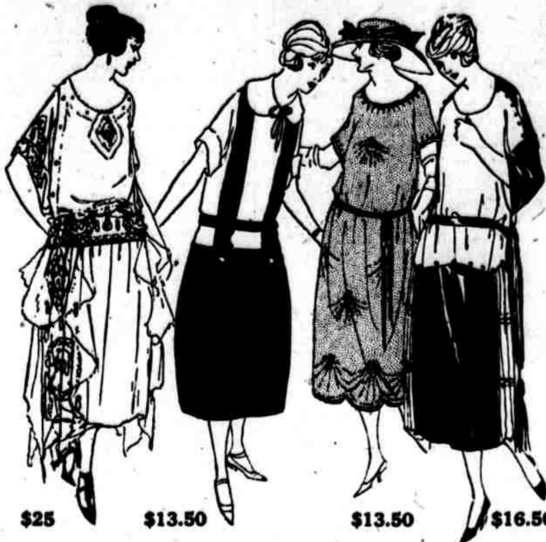
$25 $13.50 $13.50 $16.50