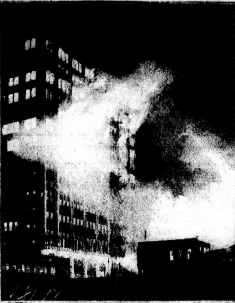
The general office building of the Chicago, Burlington and Quincy Railroad as it appeared at the height of the fire which destroyed an entire square in the business section of Chicago. The structure was supposed to be fireproof in every respect.