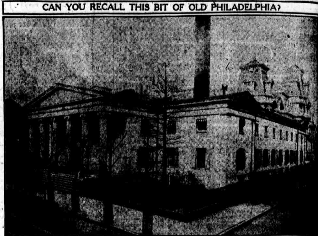
CAN YOU RECALL THIS BIT OF OLD PHILADELPHIA?