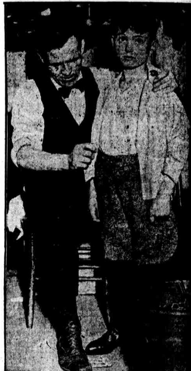
GETS NEW CLOTHES. A lad being fitted up with needed raiment by the Emergency Aid in connection with Bureau of Compulsory Education work