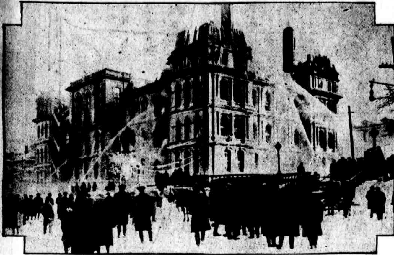
MONTREAL'S CITY HALL WRECKED BY MIDNIGHT FIRE. The photograph was made when the fire fighters had the blaze under control on Sunday morning. Thousands of historic records and works of art were destroyed.