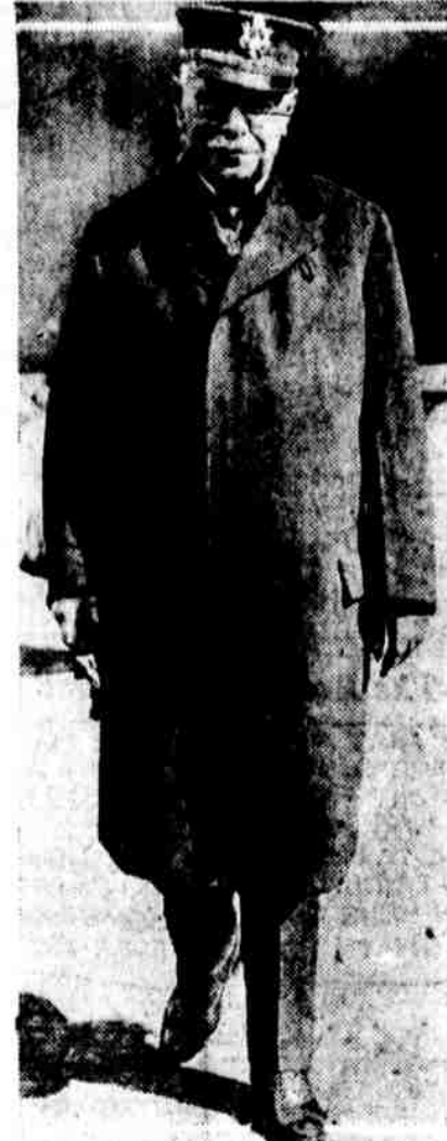
LIEUT. COM. JOHN PHILIP SOUSA on Broad street yesterday afternoon.