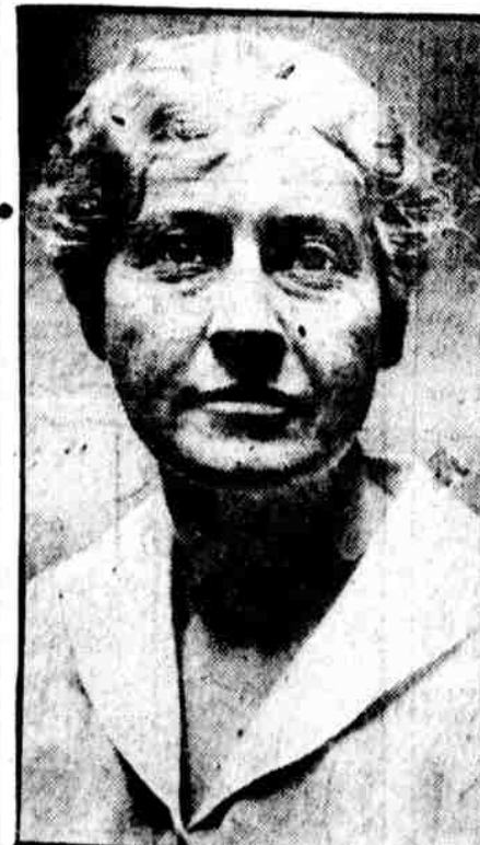
MISS ANNA VAUGHAN HYATT, sculptress, made Legion of Honor member by France.