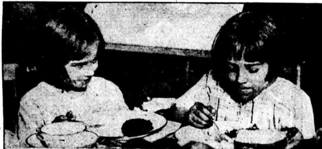
THEY'RE HAVING A GOOD TIME. Twin sisters lunching at the headquarters of the Gospel Guards, Cambria street and Kensington avenue.