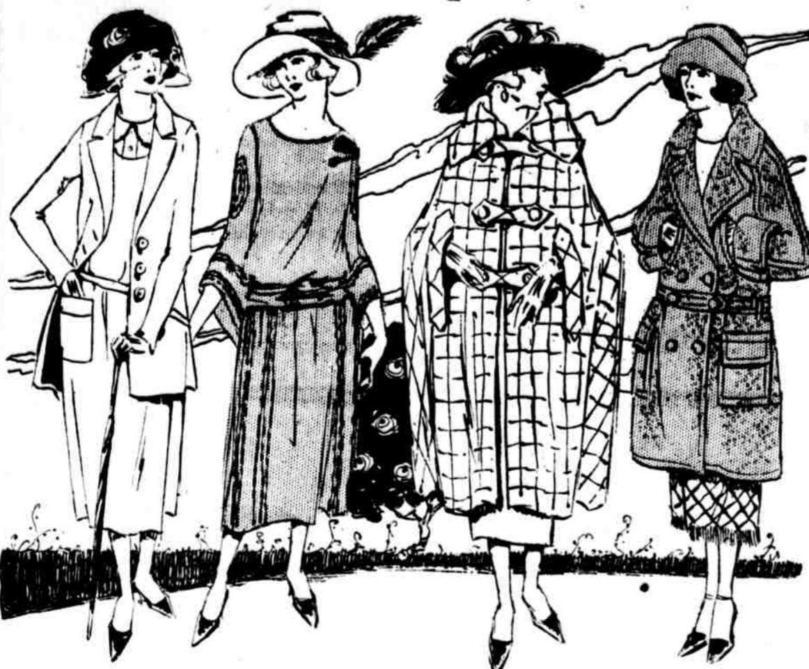
Three-Piece Tweed Suit, $15