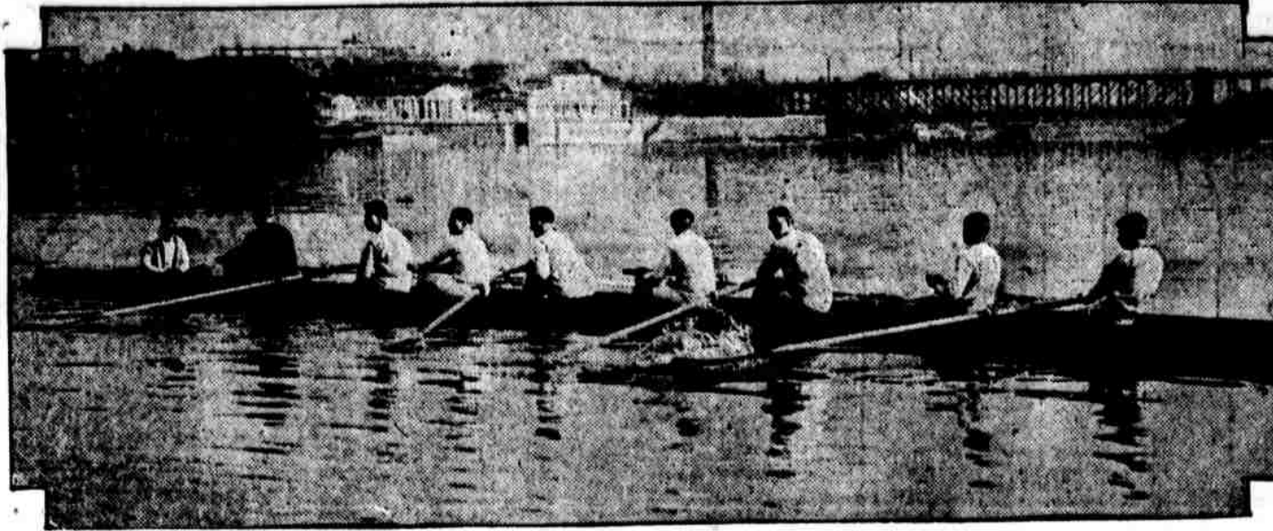
DURING A WORKOUT on the Schuylkill River. The Junior varsity eight did a lot of practice work on Saturday afternoon above the Fairmount Dam