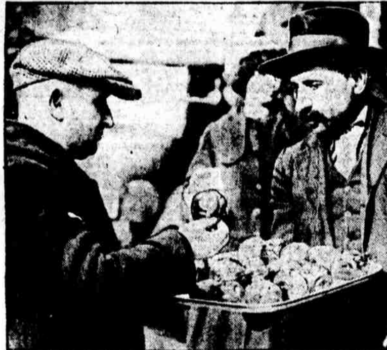
BUSINESS IS BRISK. The seller of baked apples was working near his street oven, on Fourth street below South street. Price of apples, two cents