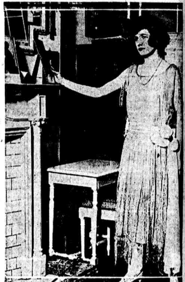
PART OF PRINCESS MARY'S WEDDING TROUSSEAU. The dinner gown is of mauve chiffon, over blue, in sweet-pea shades with lace trimmings