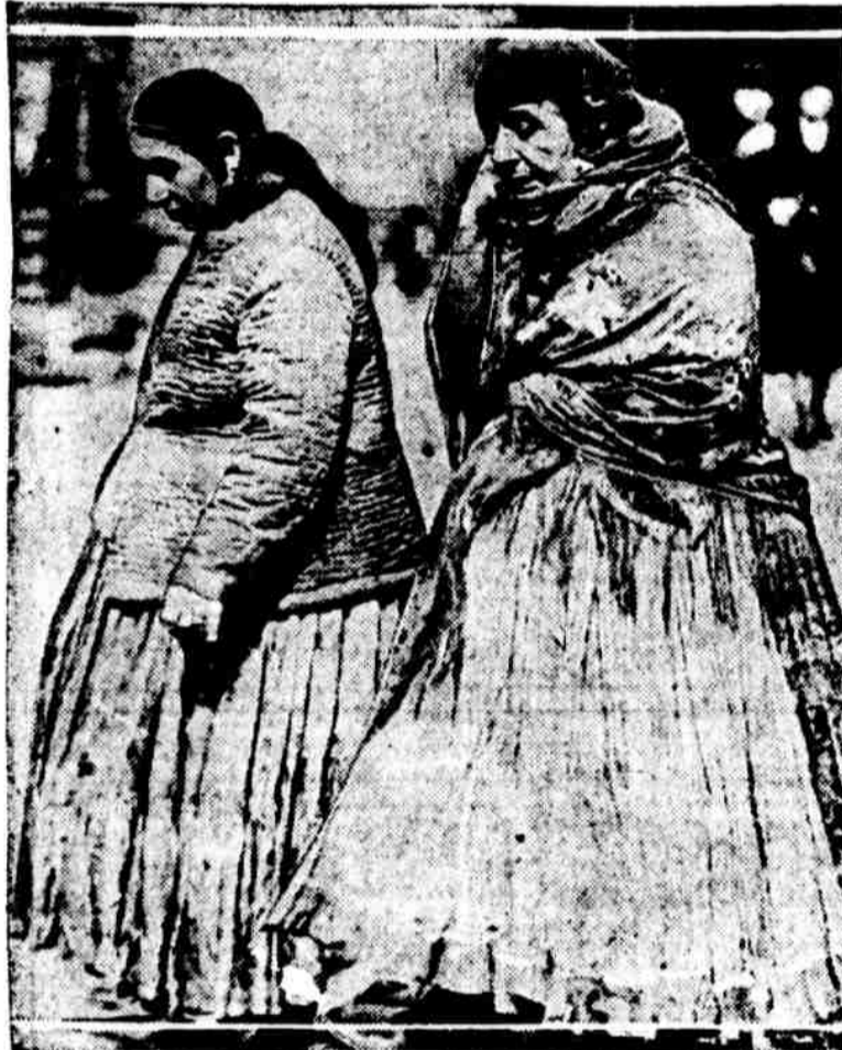
SHOPPING AND MARKETING. Two gypsy women were photographed as they passed from cart to cart on South Fourth street near Catharine