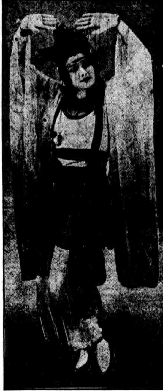
CLOTHILDE SAKHAROFF, new Russian dancer, who is making big hit this season in Paris