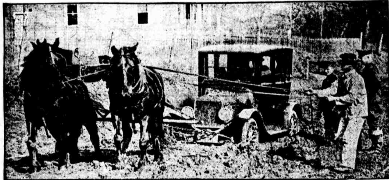
INDICATING THAT THE SUN IS DOING GOOD SPRING JOB. A spot on a road near Wrightstown, N. J., which was frozen hard a few days ago. The horses pulled the automobile from the mudhole