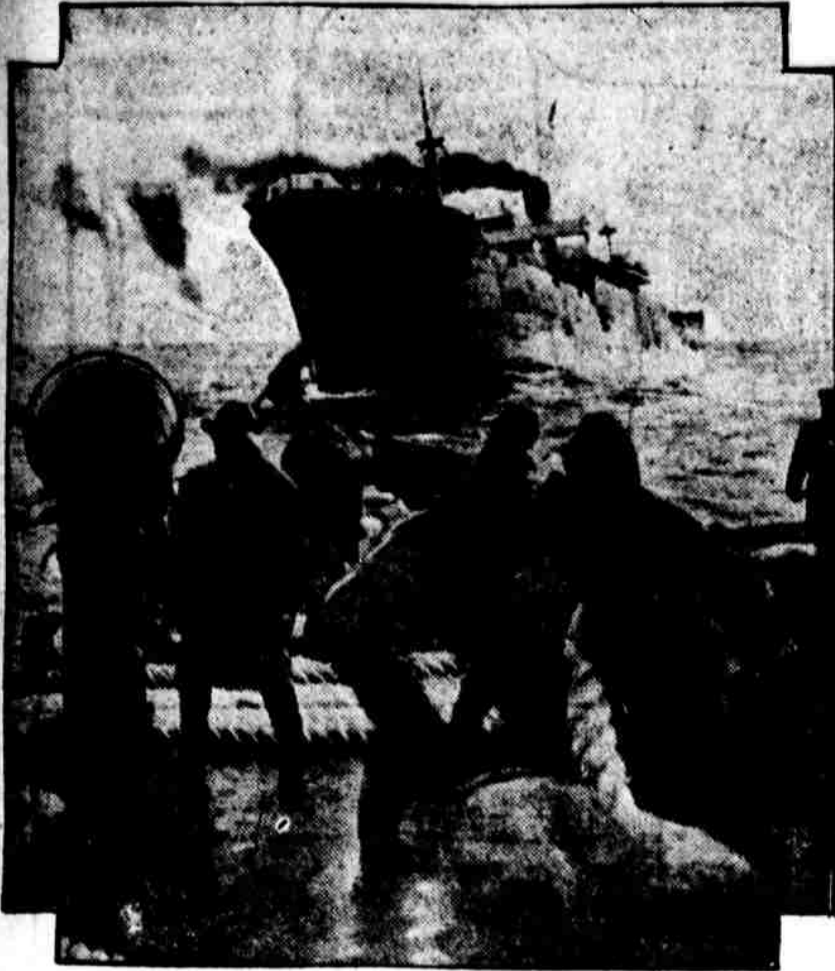
U. S. COAST GUARDS SAVING DISABLED SHIP. U. S. Merchantman "West Carnifax" is at the mercy of wind and waves as lifeguards make effort to "shoot" a line to the boat