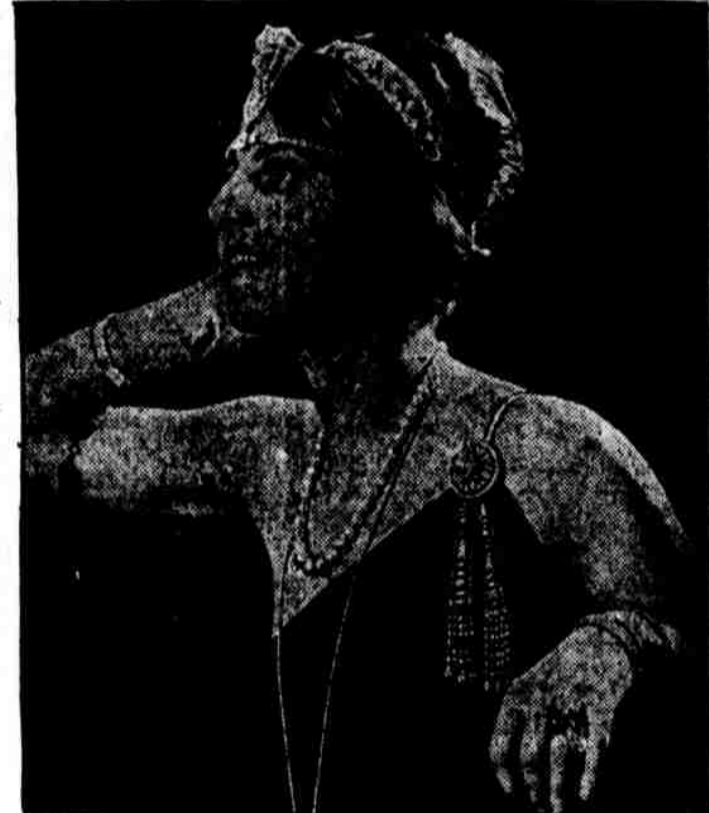
A MILLION-DOLLAR OUTFIT. Jewelry and evening gown which will be worn at Rumanian War Orphans' benefit, to be held in New York