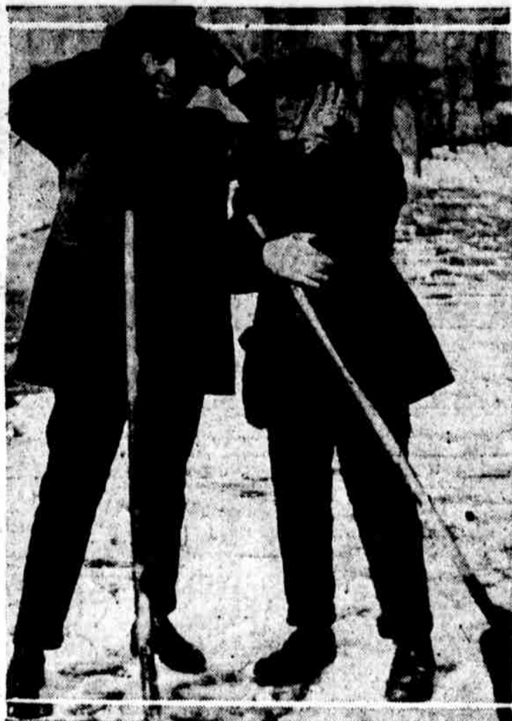
THEY HAD A COLD BUT WELCOME JOB. Some of the unemployed hired by the city to remove snow and ice from Independence Square walks