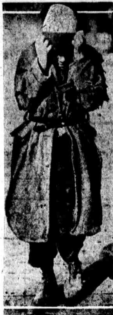
BR-R-R—SOME COLD. Running an errand for mother. He's pulling the cap down tight