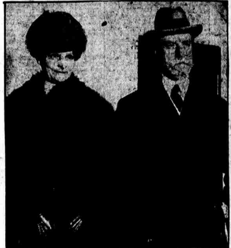
ON THEIR WAY TO BERMUDA. Charles Evans Hughes, Secretary of State, and Mrs. Hughes, passengers on the steamship Fort Hamilton