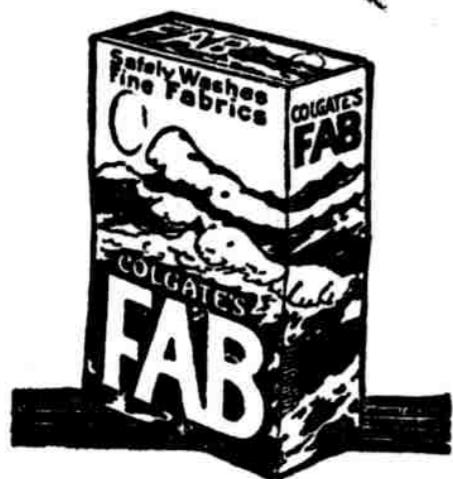
The new COLGATE wash-bowl flakes