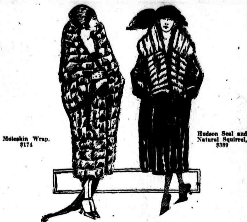
Mole Skin Wrap. $174