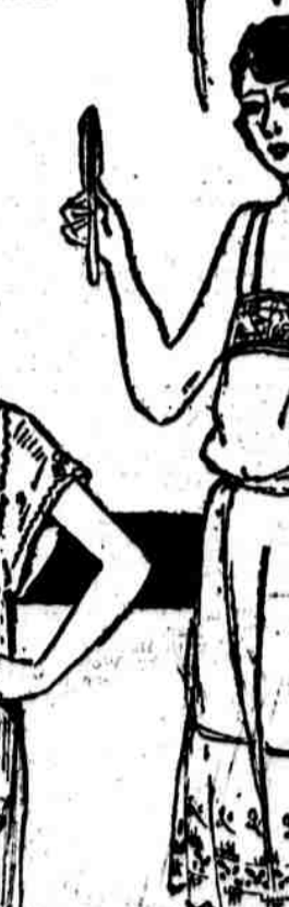
Two Petticoats—Like This—For $1