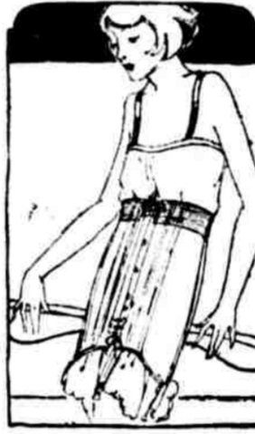
Satin at $3.85