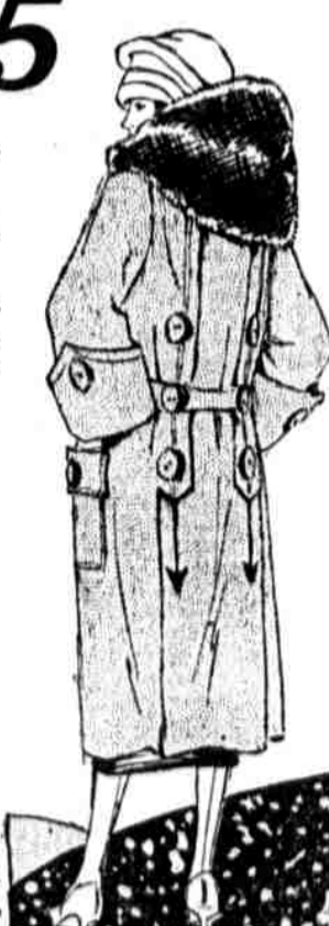
Now $7.75 Was $20 —Gimbels, Subway Store.