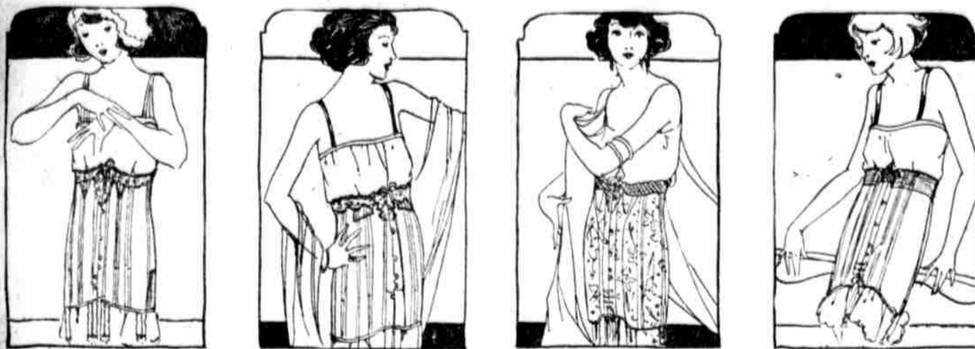
Lace-Trimmed Coutil, $2.85 Pink Coutil, $2.85 Brocade at $3.85 Satin at $3.85

A new kind of Sale—style variety so great there's practically "specialized" service. And Every Corset Fresh From Its Tissue Wrappings! Low-Bust Corsets Sports Corsets Firm, "Suit-Wear" Corsets Waistline Corsets Plain Coutils : Novelty Pekin-Stripe Coutils : Rich Broches— Pink or White—Shimmering Rose-Pink Satins At $2.85 Regular $5 Corsets At $3.85 Regular $6.50 to $10 Corsets