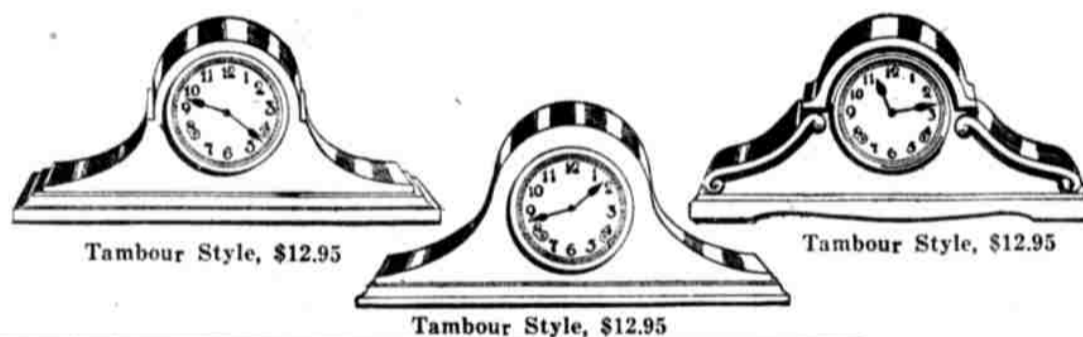
Tambour Style, $12.95

Beautiful tambour cases—mahogany finish. Pictured at right. From William E. Gilbert Clock Co. Half-hour strike on musical two-tone gong. 9 3/4 and 10 ins. high—20 and 20 1/2 ins. wide.