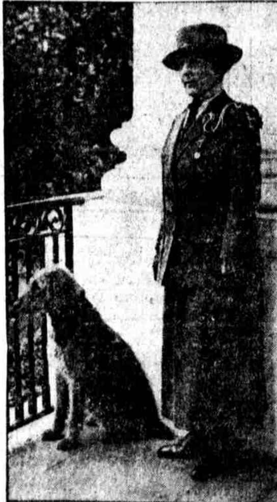
IN GIRL SCOUT UNIFORM. Mrs. Warren G. Harding posed at the White House with "Laddie Boy."