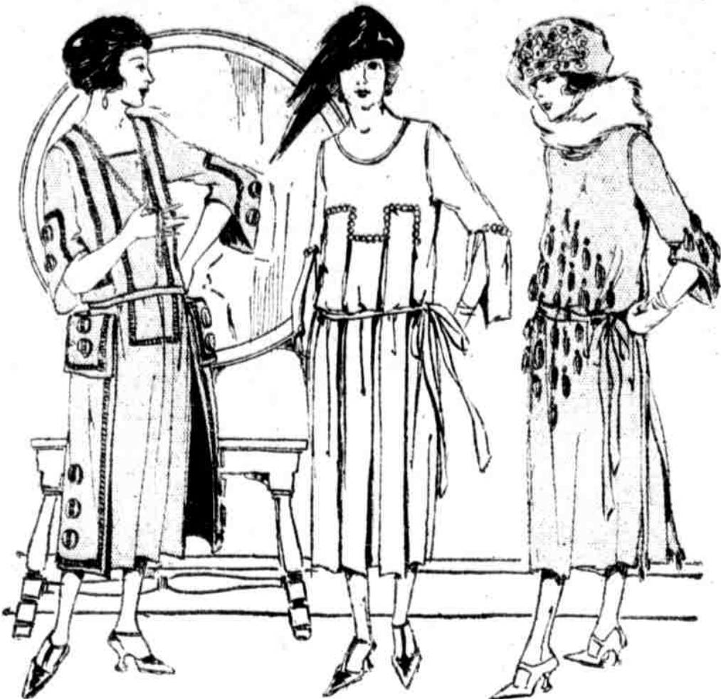
Tricotine Satin-Faced Canton Satin-Faced Canton