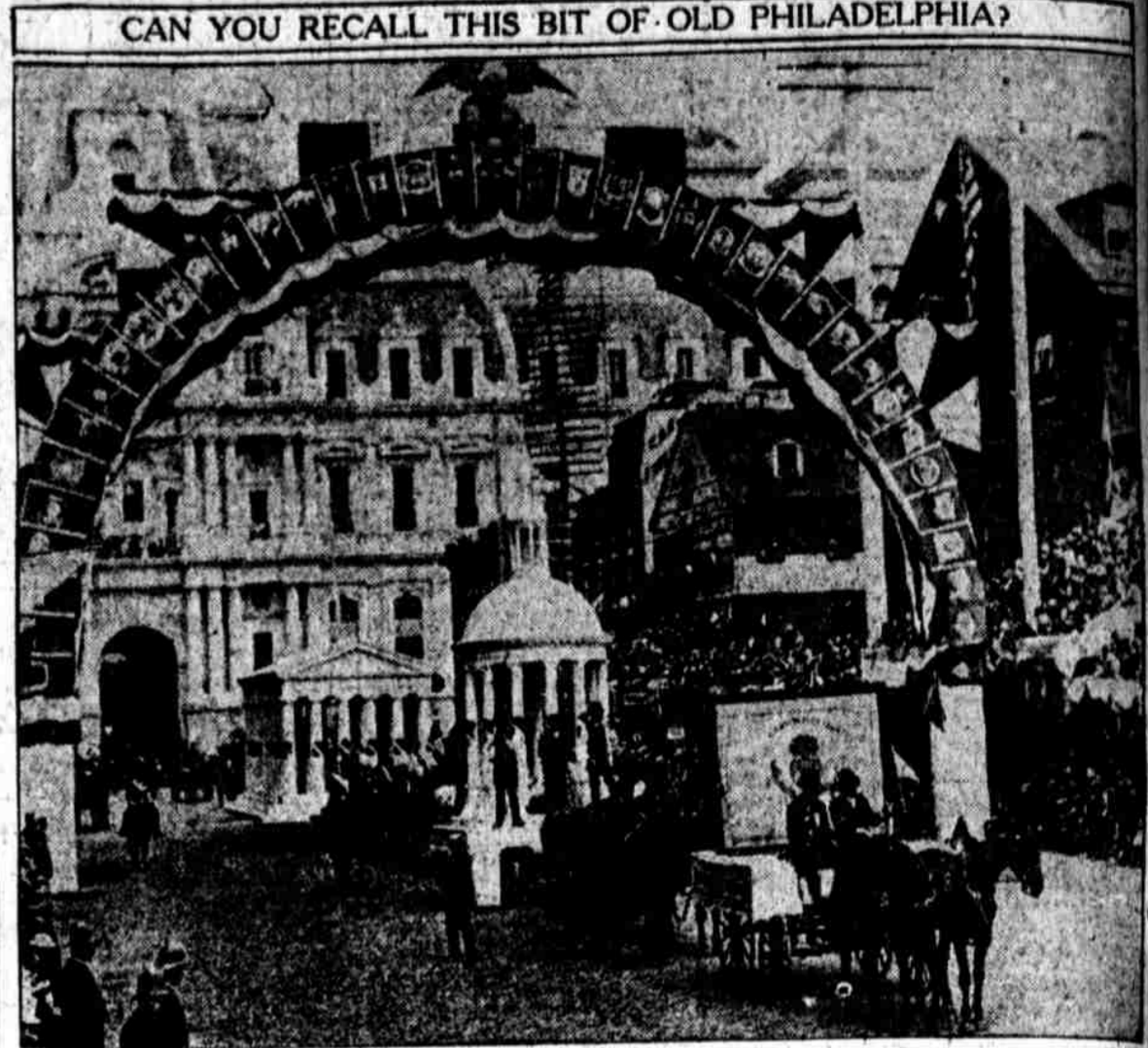
CAN YOU RECALL THIS BIT OF OLD PHILADELPHIA?