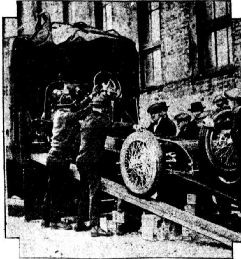
CARS ARRIVE. Automobiles displayed at Philadelphia's 1922 show arriving in vans from the New York show. Yesterday was a busy day at the Commercial Museum