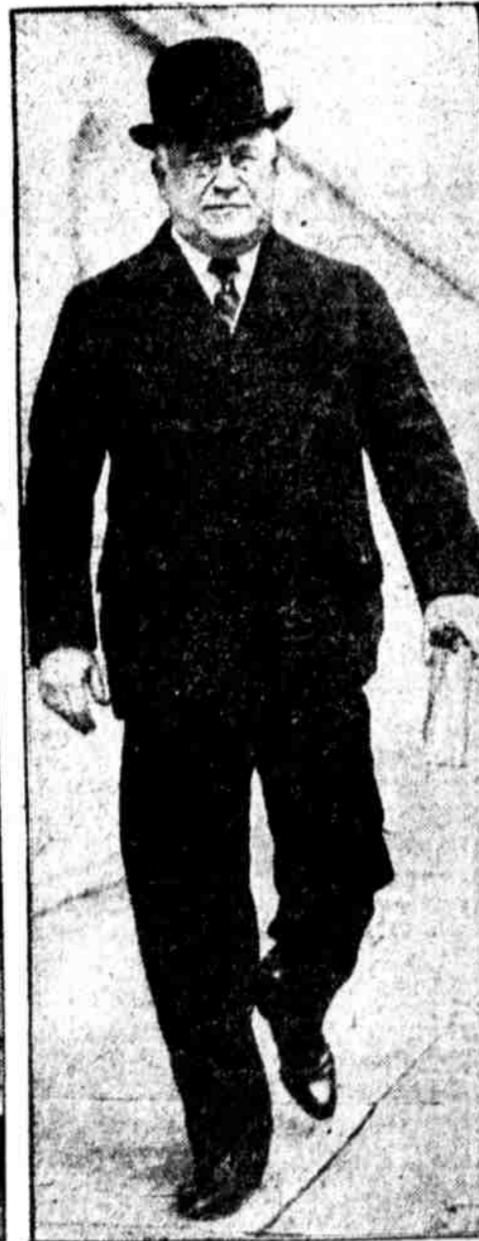
JUST BEFORE SENATE VOTED. Senator Truman H. Newberry, of Michigan, holds his seat