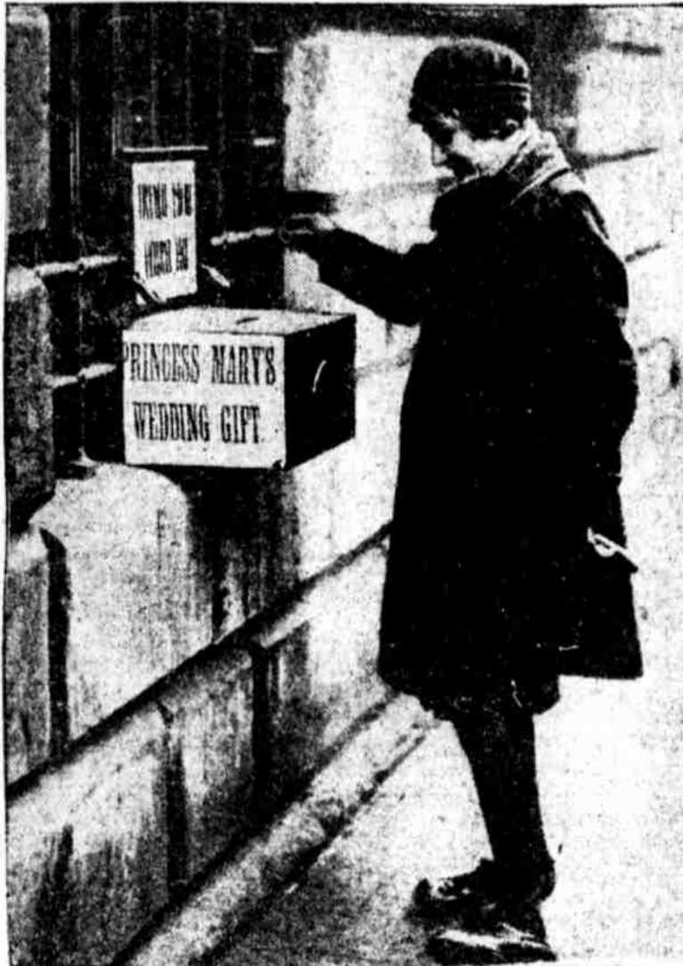
TAKING A PUBLIC SUBSCRIPTION. This is one of the many boxes seen throughout England, where contributions can be made to the public's wedding gift to Princess Mary