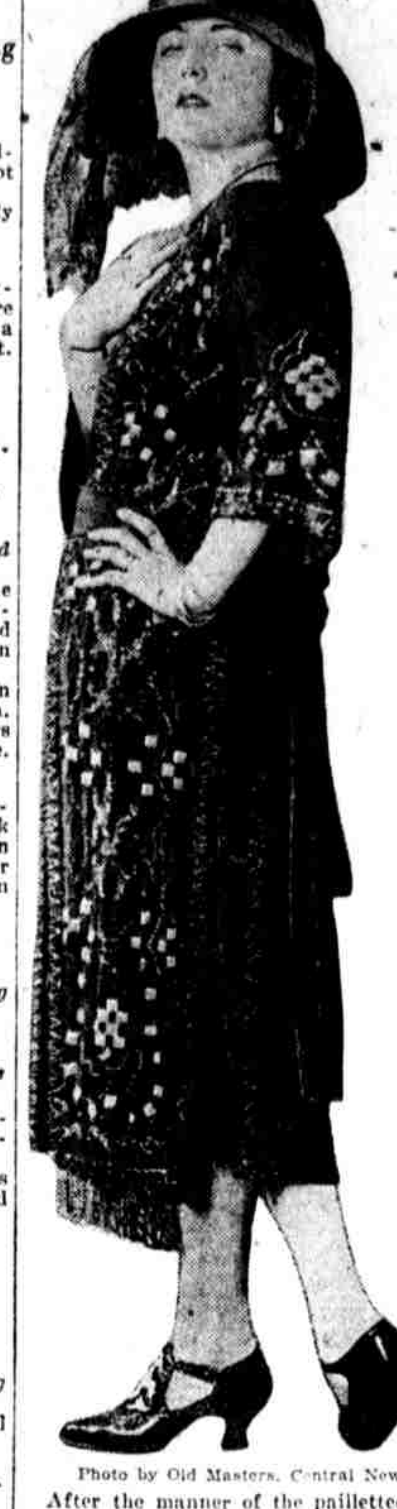
After the manner of the pailletted evening frock, this dress is covered with a chiffon slip that is heavily beaded. Its cut and the elaborate decoration make it suitable for the kind of affair to which you would wear a hat of this dressy type with the lace veil draping it gracefully