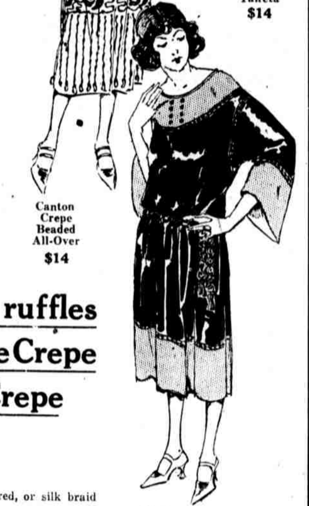
Canton Crepe Beaded All-Over $14

Spring taffetas with ruffles Nail-headed satin-face Crepe Cut-steel beaded Crepe de Chine