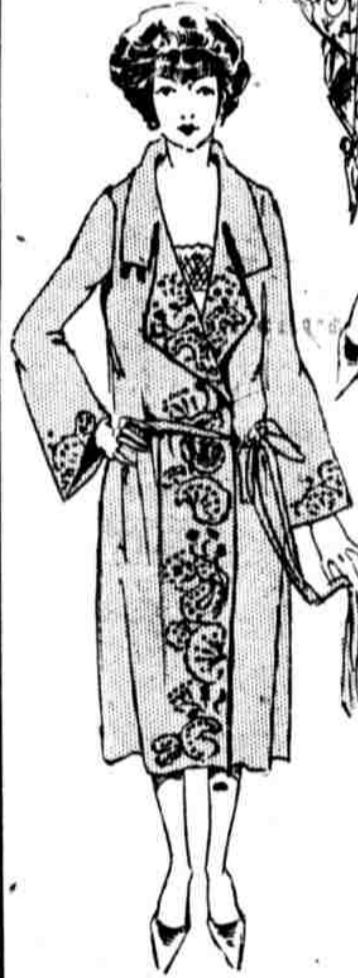
Poiret Twill $14