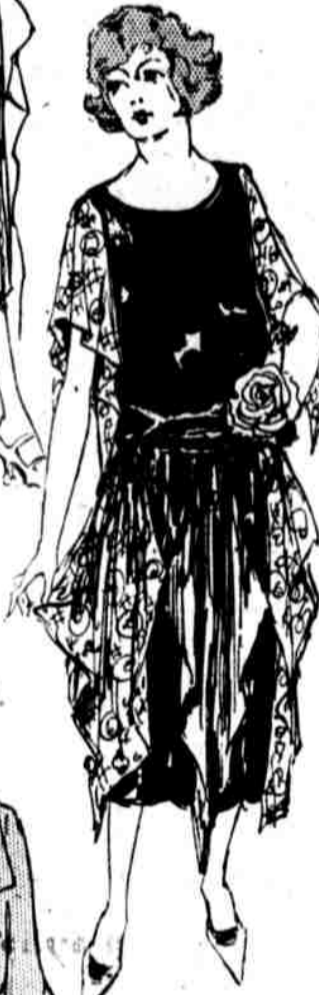
Canton Crepe and Lace $14