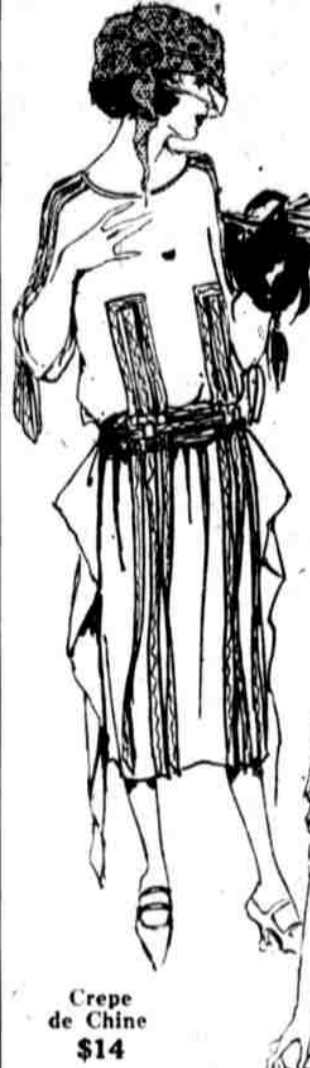
Crepe de Chine $14

Canton crepes, Roshanara crepes, plain Canton crepe combined with jacquard crepes, beaded Canton crepes, iridescent beaded Canton crepes, charmeuses with chenille tassels, and the famous "handkerchief drape." Tricotines with flat silk braid banded and interlaced. Canton crepes with interlaced crepe ribbons. Two styles in lace combined with crepe de chine. Canton crepes with contrast-color borders—black, for instance, with henna-color bodice, yoke top, sleeve borders, skirt hem.