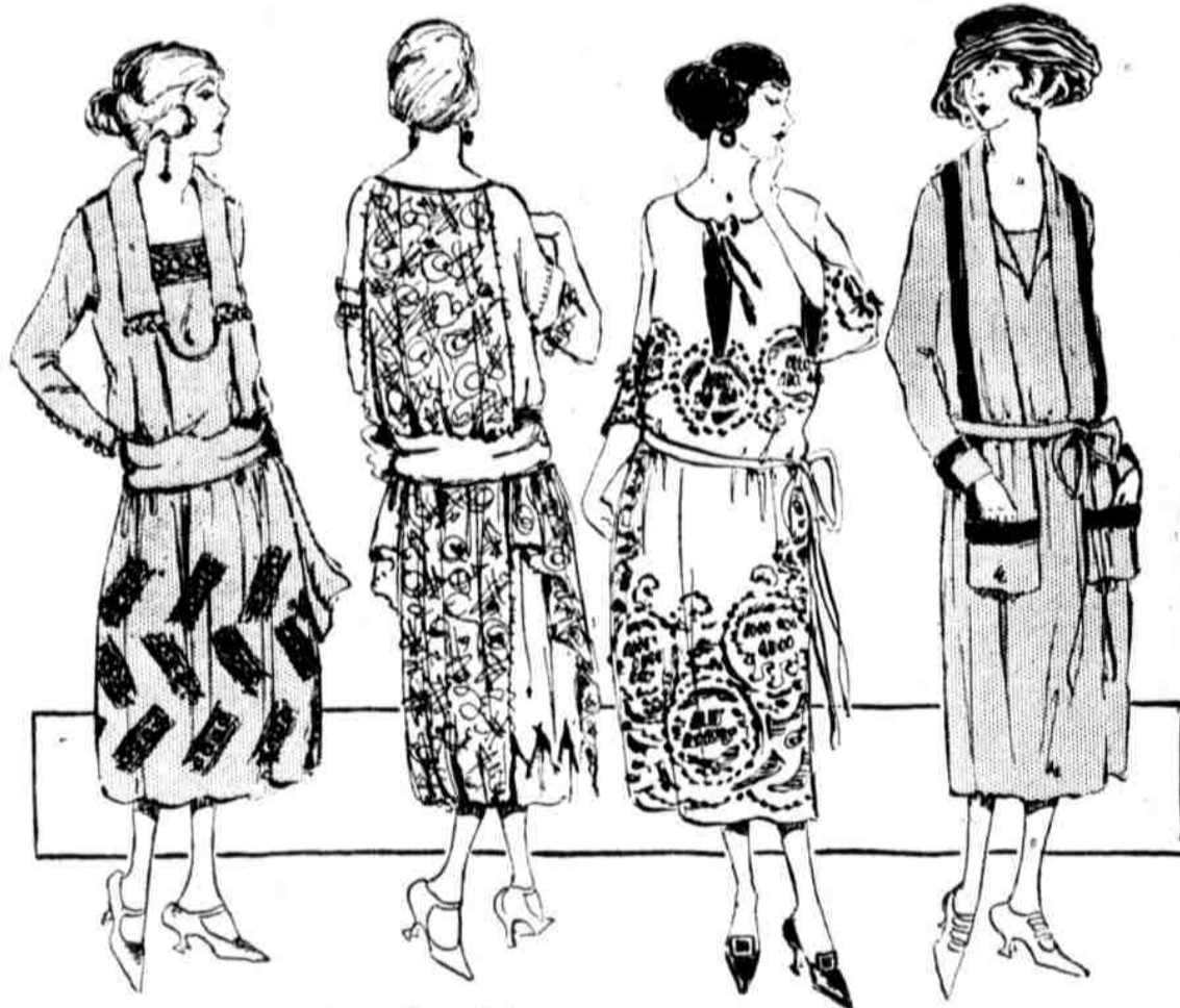
Taffeta, $16.75 Georgette and Lace, $29.75 Poirer Twill, $29.75 Jersey, $16.75

at $16.75 Values $22.50 to $25 And All Spring Models