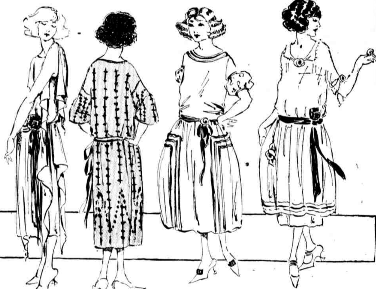
Canton Crepe, $29.75 Tricotine, $16.75 Taffeta, $29.75 Georgette, $16.75