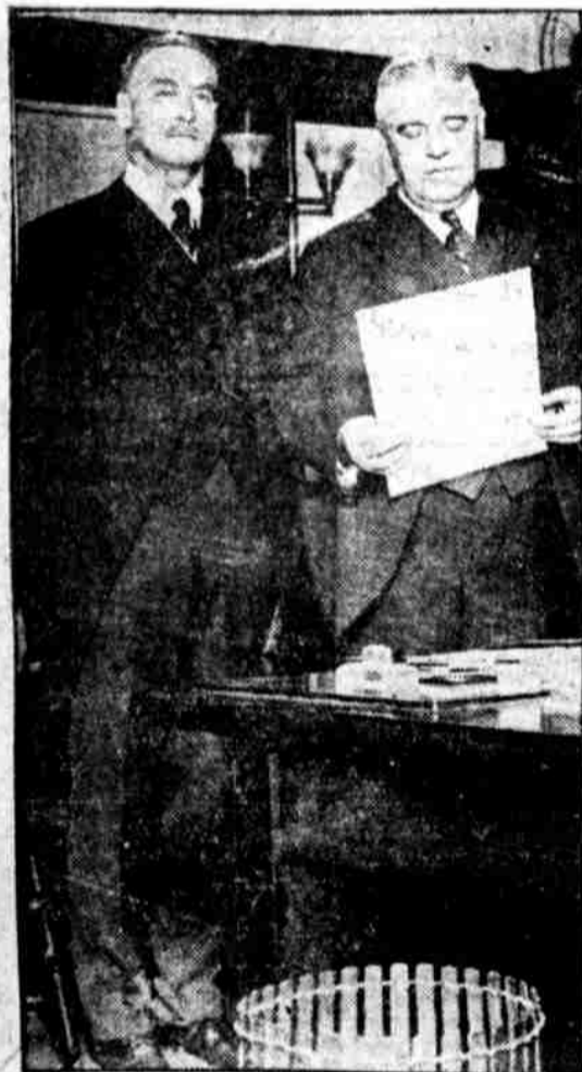
THE NEW SENATOR. Governor Sproul is holding certificate of appointment that made George Wharton Pepper interim successor of the late Senator Penrose. Mr. Pepper is a devotee of outdoor life.