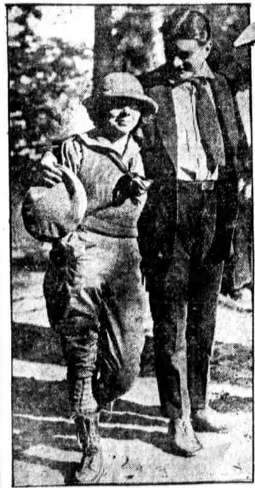
MARRIED. Mrs. Allan Forrest was Lottie Pickford, and is a sister of Mary. Hubby is a film player. C.A.U.