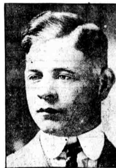
WILLIAM O'TOOLE, of Gary, W. Va., new United States Minister to Paraguay. C.N.P.