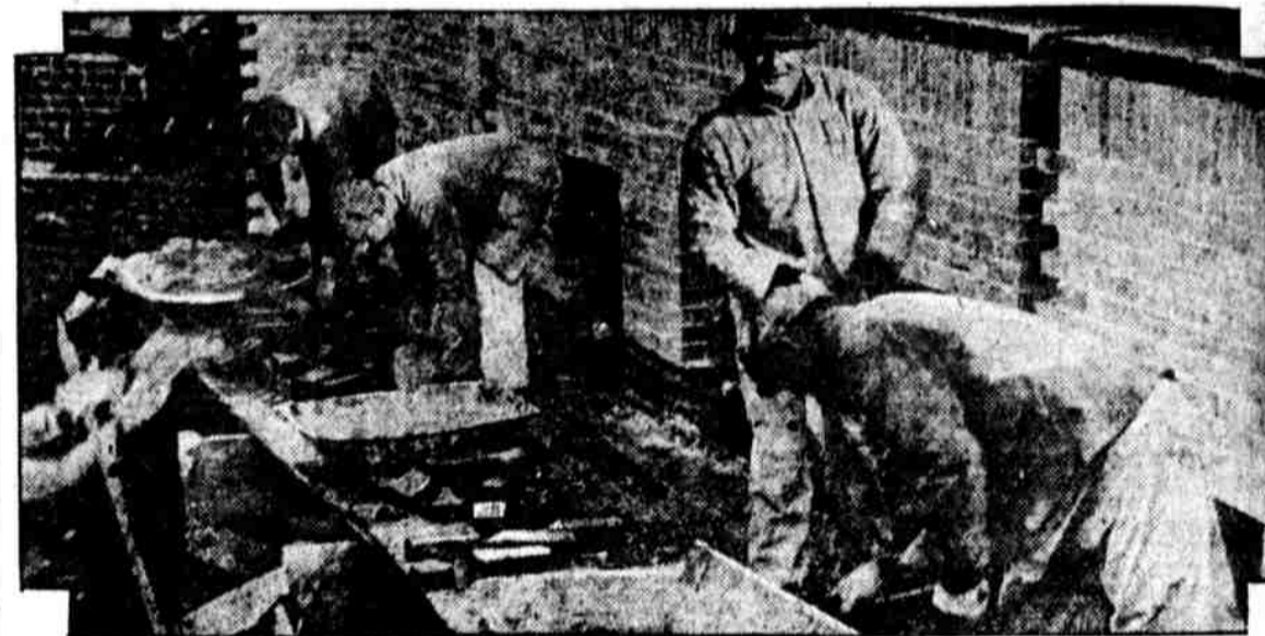
NEARING COMPLETION. The Worth street station of the Frankford "L" is about ready for use. Frankford people watch the work on the station and are hopeful.