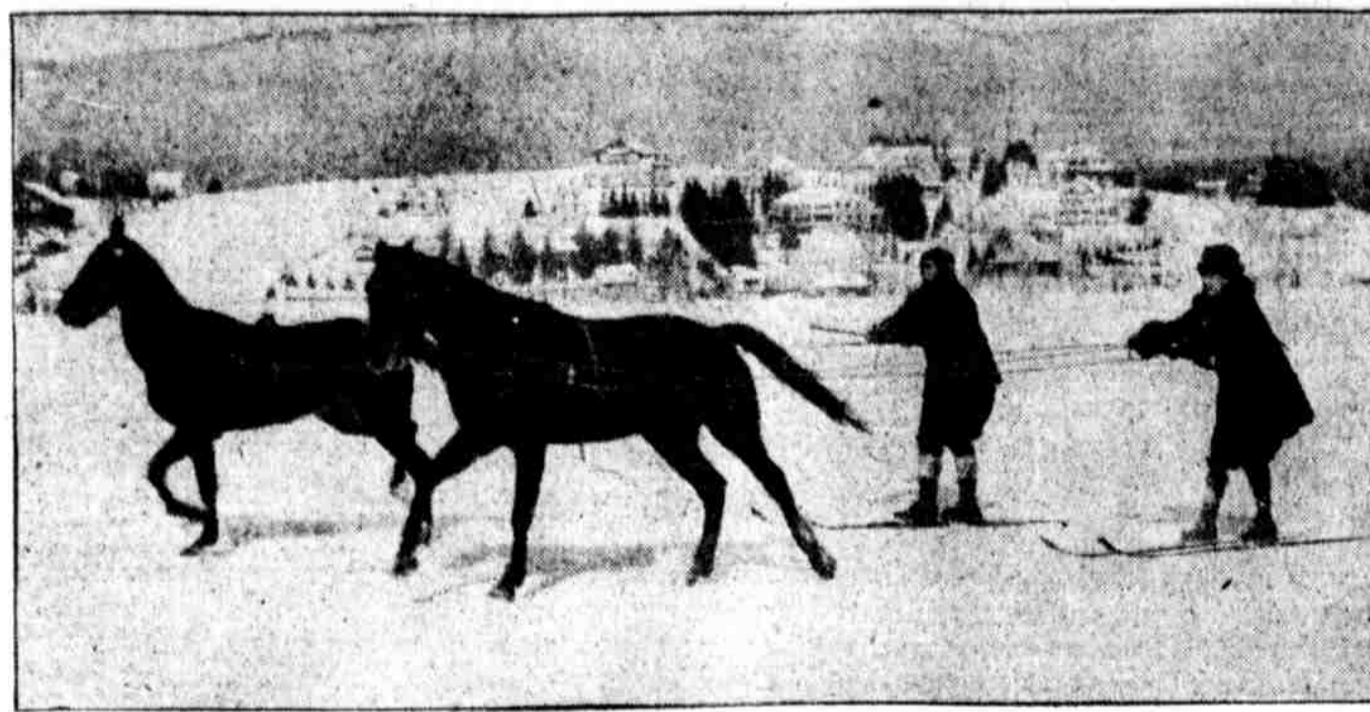
ONE OF THE JOYS OF WINTERTIME. Horses pull the skiers over the ice and snow at a rapid rate. The photograph was taken at Lake Placid, New York.