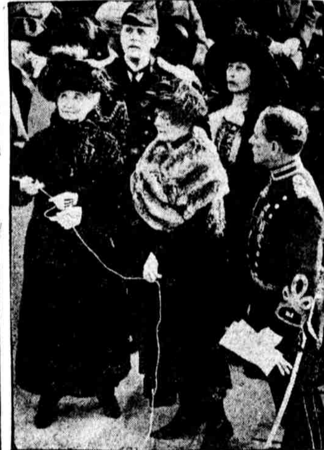
FRANCE PRESENTS JOAN D'ARC STATUE TO WASHINGTON. Madame Jusserand, wife of French Ambassador, and Mrs. Harding pull unveiling string.