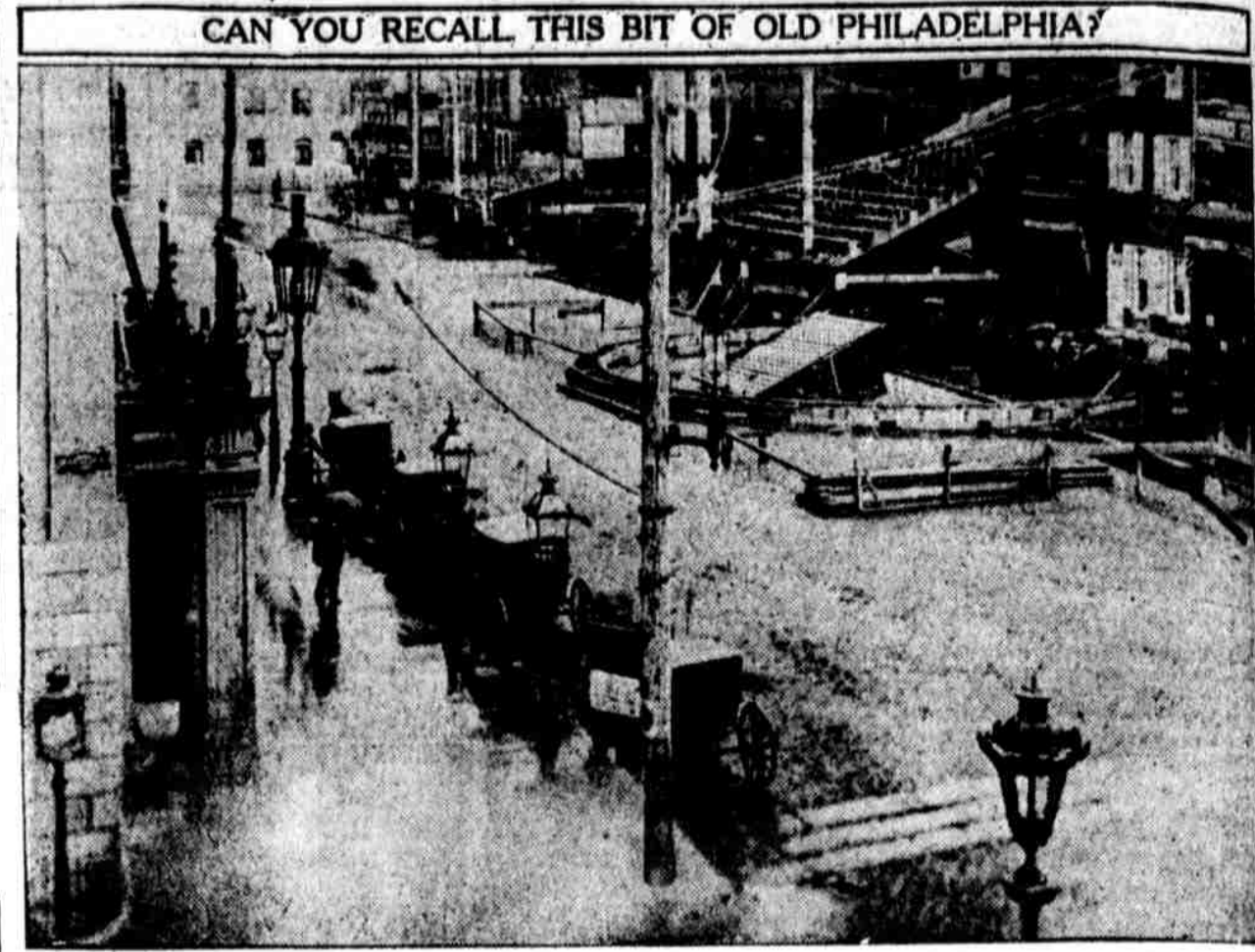
CAN YOU RECALL THIS BIT OF OLD PHILADELPHIA?