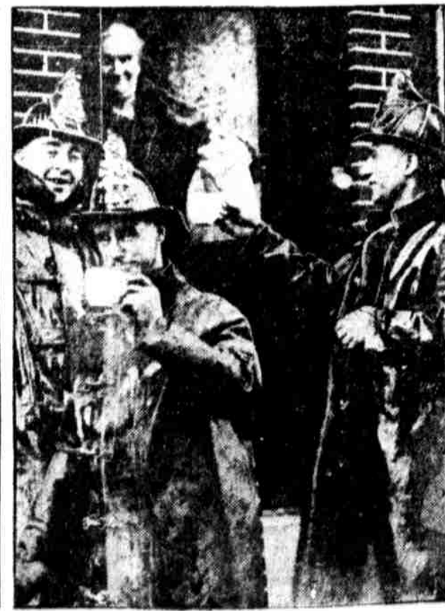
HOT COFFEE FOR FIREMEN. As Norris Square Methodist Episcopal Church was burning Saturday, this neighbor was busy.