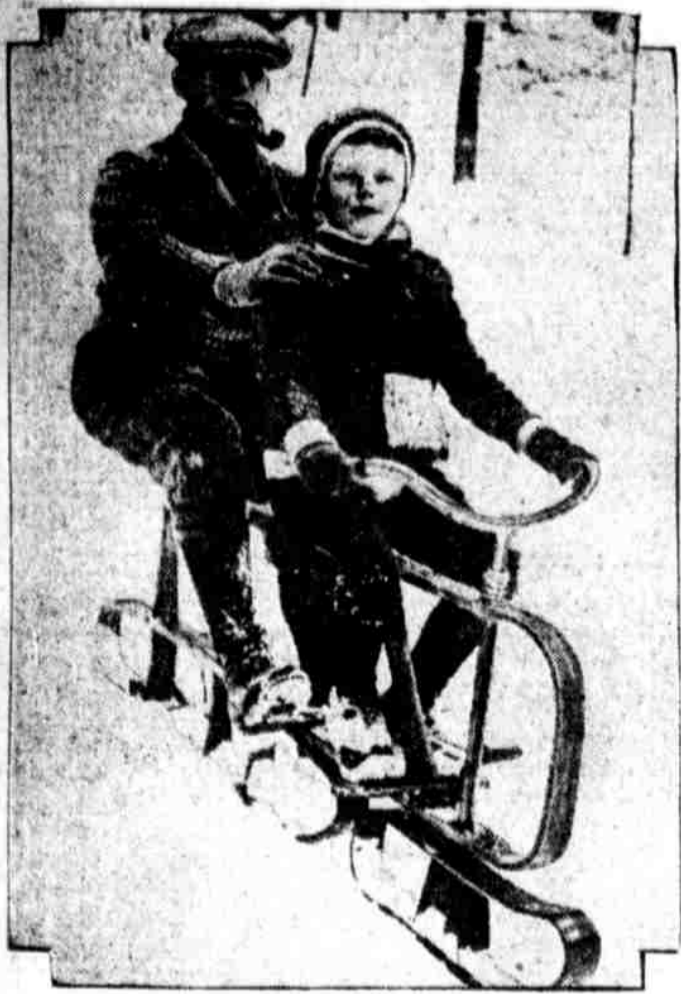
THE LATEST IN COASTERS. Over in Switzerland, where they have lots of snow, most of the time gravity supplies the necessary power.