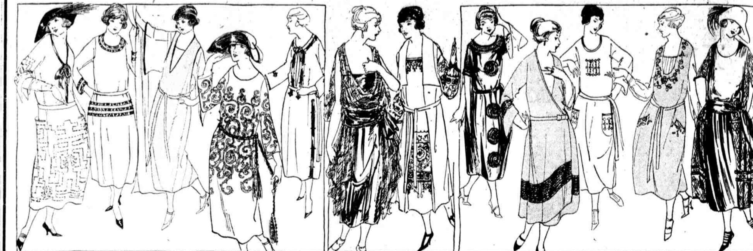
A—$16.50 B—$5.50 C—$10 D—$12.75 E—$15 F—$20 G—$16.50 H—$10 I—$20 J—$5.50 K—$10 L—$10

Who wants to see something new? Who wants to be FIRST to wear the new frocks? Who craves dresses extremely becoming and yet extraordinarily inexpensive? Everybody, of course! And of course Wanamaker's Down Stairs Dress Store is ready! Fifteen hundred early Spring dresses are here in this Spring Sale at $5.50 to $25. Two hundred new Spring styles!