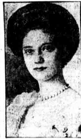
EX-EMPRESS ZITA seeks to place her son, Crown Prince Otto, on throne of Hungary at Budapest. The Prince is nine years old.