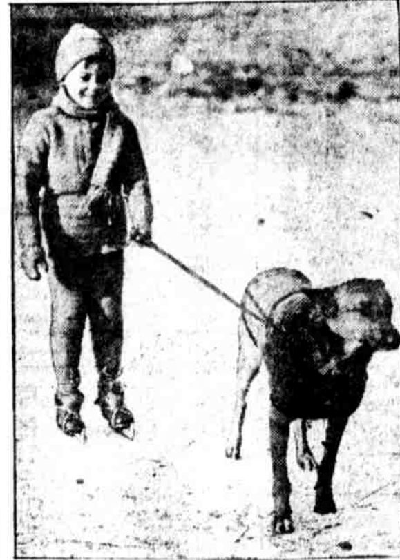
GET A DOG AND SKATES—THEN IT'S EASY. This Holland boy has the right idea. The dog is well dressed for zero weather.