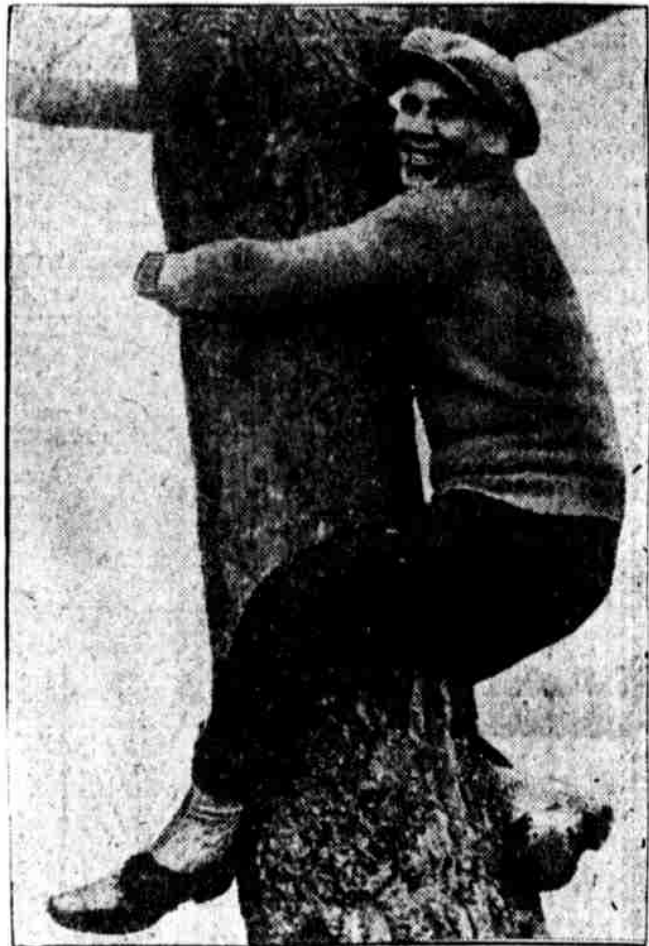
FIFTEEN MINUTES OF TREE CLIMBING A DAY. George Cook, training to fight Carpenter in England, recommends it.