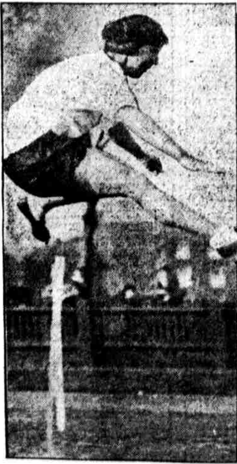
HURDLING. A student of the London Polytechnic School getting ready for meet with French girls in Paris.