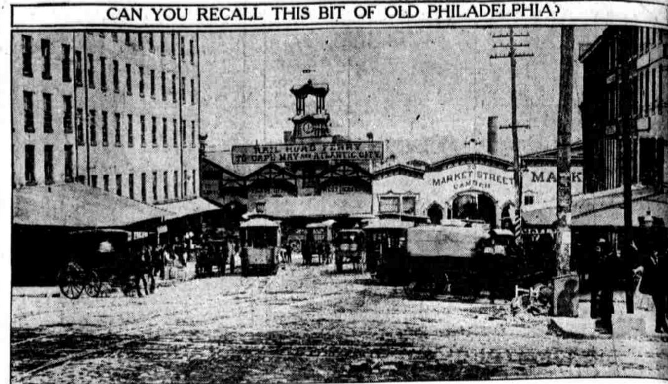
CAN YOU RECALL THIS BIT OF OLD PHILADELPHIA? FOOT OF MARKET STREET THIRTY YEARS AGO. These ferry buildings stood where the Market street ferry house is now located. Note that the cable cars run down the hill to Delaware avenue. The climb up the hill was not necessary as it is today for passengers using surface cars. The Ridgway Hotel is at the left. Have you an old Philadelphia photograph? Send it to the EVENING PUBLIC LEDGER.