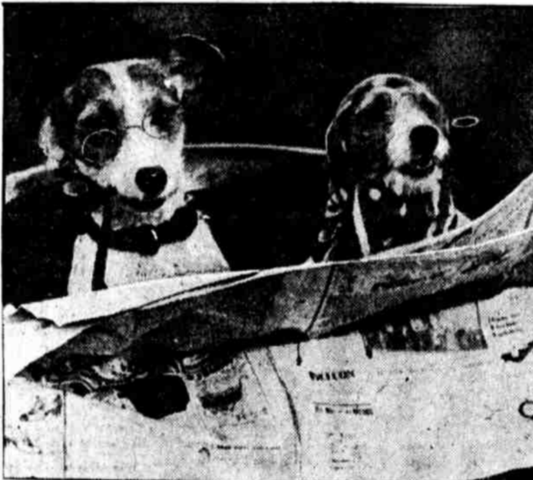
CONTENTED IRISH TERRIERS. Joan and Darby, two full-blooded dogs, owned by a Dublin Sinn Feiner, posed behind a daily newspaper in London.