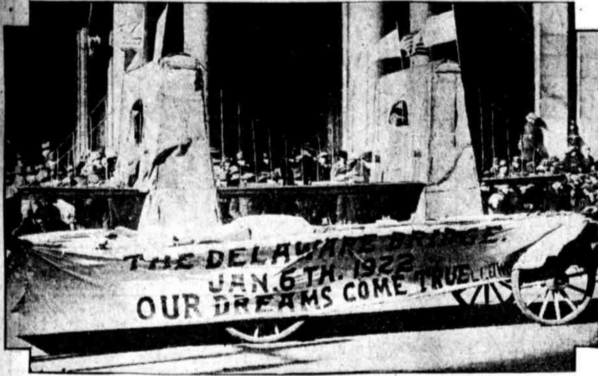
WON SECOND PRIZE FOR FLOATS. The Camden Clowns took $125 as a prize for this Delaware River Bridge float in yesterday's Mummers' parade. It was timely, due to the fact that ground will be broken this week for the long-hoped-for bridge.