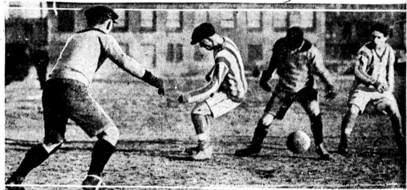
IT WAS TOO COLD TO FINISH SOCCER CONTEST. Several scores were tallied in the contest between the Fairview eleven and the Puritan Club at Second and Clearfield streets yesterday afternoon, when it was decided to quit on account of the freezing weather.