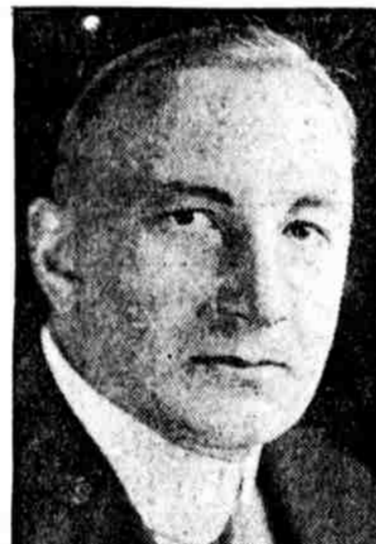
LEONARD ASTROM , new Minister from Finland to Washington.