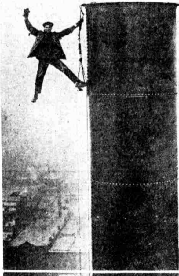
HE CARES NOT FOR COLD WEATHER. Allen Crippen, Chicago steeplejack, at work on smokestack of Stock Exchange Building, Chicago.