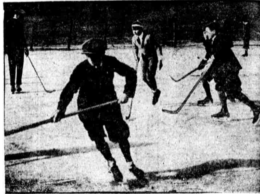
THE BOYS WELCOMED CHANCE TO PLAY ICE HOCKEY. They picked sides, found a block of wood and then the game was on. No score was kept. They had a big time on the pond at Haverford.