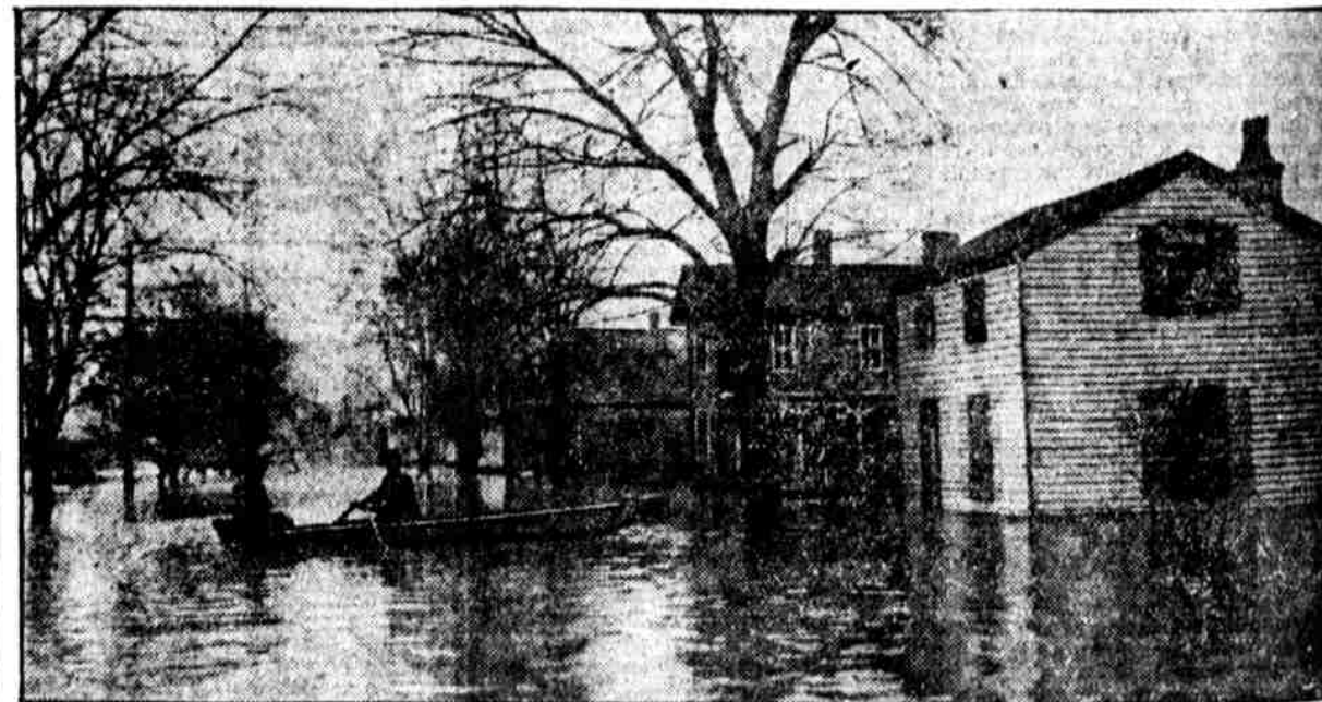
CHRISTMAS DAY AT COVINGTON, KENTUCKY. The Ohio River flood forced the people of this town to vacate their homes or move to the upper floors. Rowboats were the only means of transportation. Most of the people have returned to their water-soaked homes.