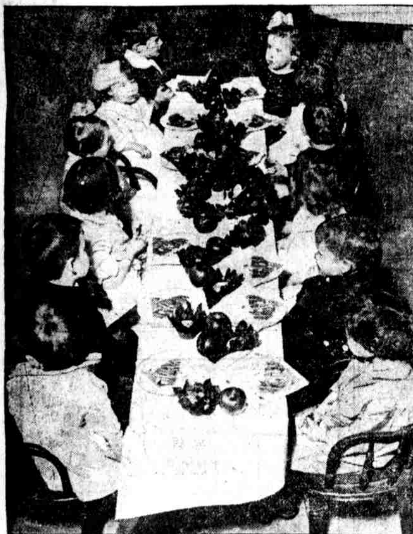
A HAPPY DOZEN. The photographer took the photograph from the balcony of the John B. Stetson auditorium while children of the Union Mission Sunday school were enjoying a Christmas treat.