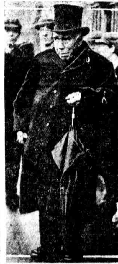
CARDINAL LOGUE leaving Dublin Conference.