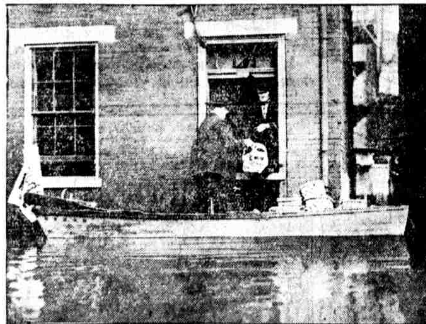
IN CINCINNATI. The Flood Relief Committee did a big job. Christmas food was taken to the homes that were surrounded by water from the Ohio River.