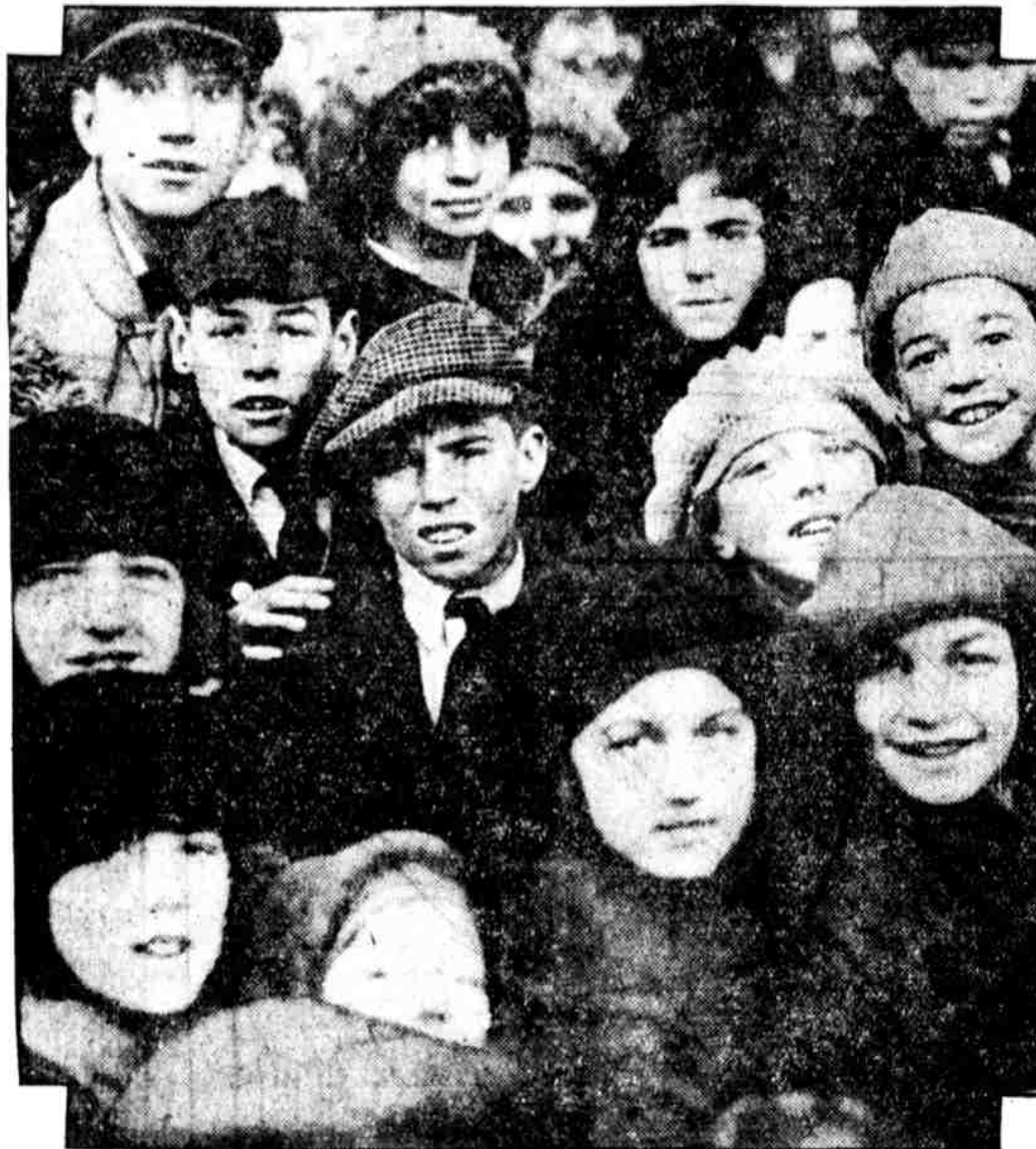
IT WAS A BIG DAY FOR THEM. Children from all sections of the city were guests yesterday of Philadelphia Elks at their clubhouse, Juniper and Arch streets. The photographer caught some of them as they waited for the doors to open.