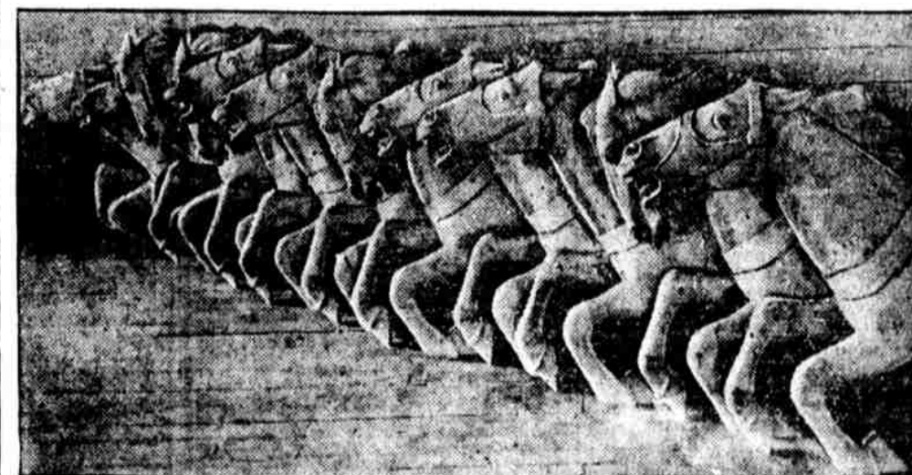
CAN YOU PICK THE WINNER? On the "home stretch" the camera caught these horses of metal and wood in a factory where they are made for the joy-producing merry-go-rounds. There is a big field to choose from.