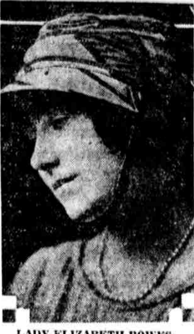
LADY ELIZABETH BOWES-LYONS

Who, it is rumored, may become the bride of the Duke of York, brother of the Princess Mary, at the same time his sister weds Lord Lascelles