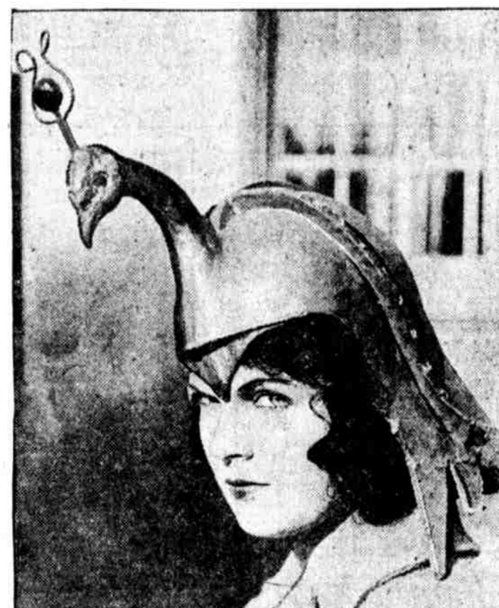
SEASONABLE HEADGEAR. Miss Jacqueline Logan, of movie fame, had it all fixed up for a Christmas party