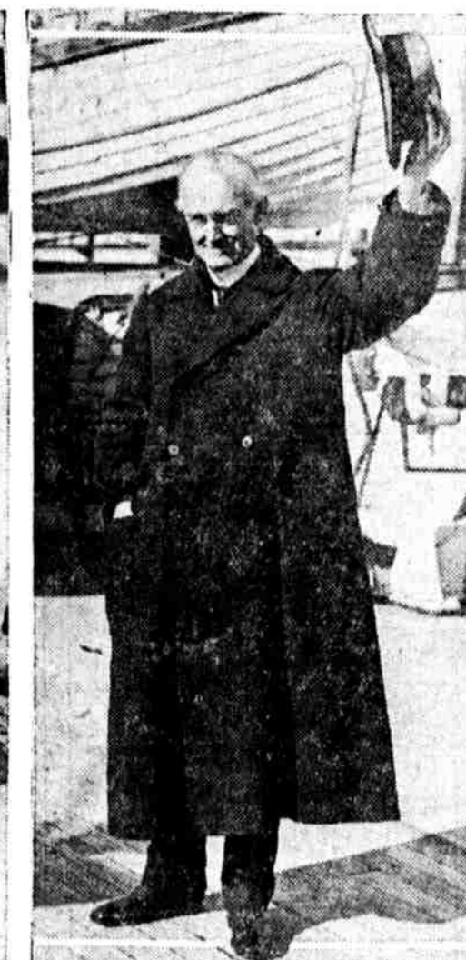
BRITAIN'S MODEST VIOLET. Lord Riddell, Lloyd George's publicity man at Arms Conference, sails for home.