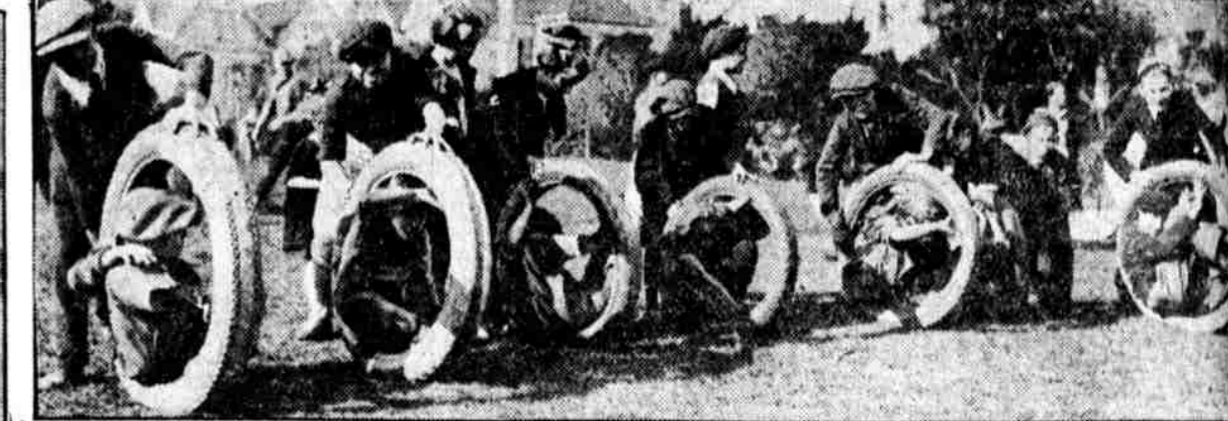
PHILADELPHIA SCHOOLBOYS, TRY THIS. The big trick is for the rider to hang on to the inside of the shoe as the roller makes speed to win the tire race. Get all the old tires you can from Dad and his friends. Maybe a league could be formed!