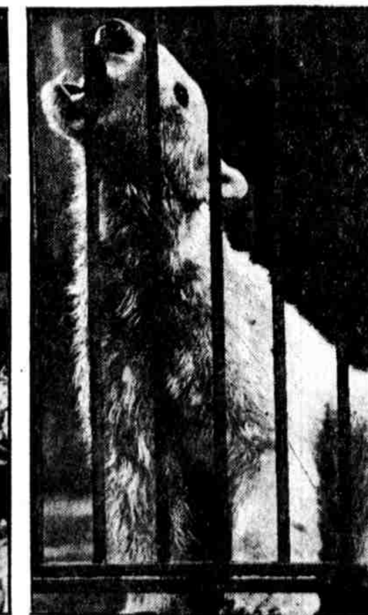
HIS CHRISTMAS HOME. Yes, they do celebrate Christmas at the Philadelphia Zoo. The keepers provide extra food