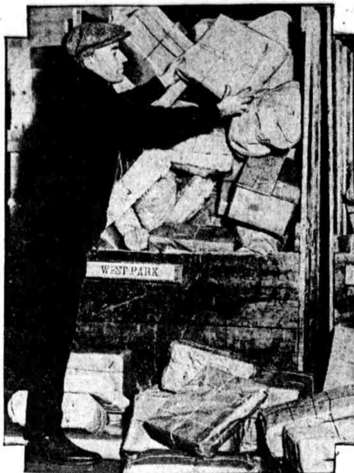
ONE OF HUNDREDS. A busy postoffice clerk of the station at Twenty-second and Market streets doing his best to see that all get their Christmas mail