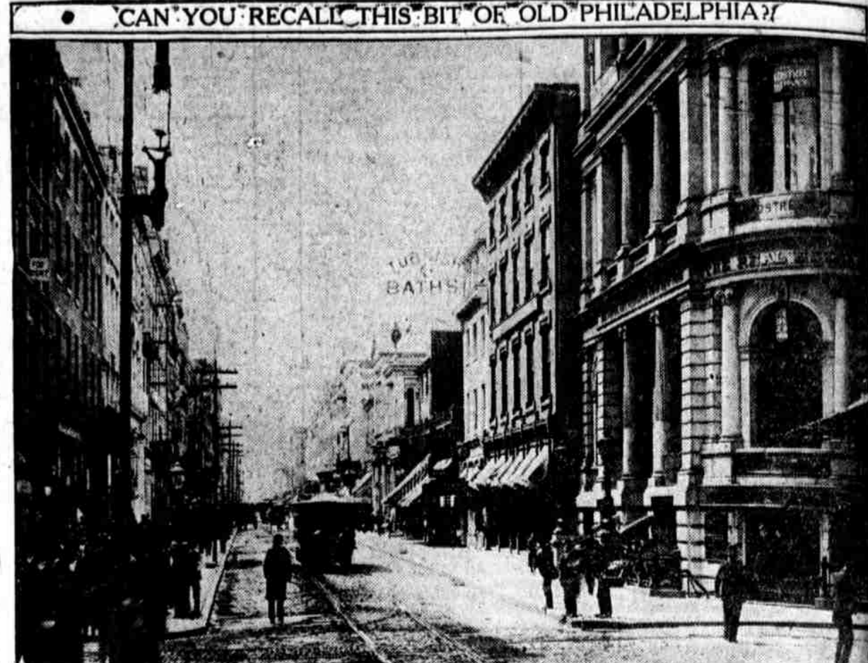
CHESTNUT STREET WEST OF TENTH STREET IN 1892. The northwest corner was about the same as it is today, but you'd be startled to see a horse car, as is shown in shown in etching. There is not an automobile in sight to break any city parking rules. The patrolman has no traffic semaphore. Note the street paving and overhead wires. Have you an old Philadelphia photograph. Send it to the EVENING PUBLIC LEDGER