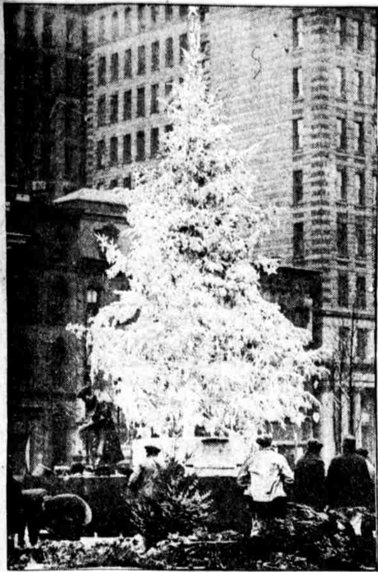
FATHER PENN'S CHRISTMAS TREE. Decorated with stars and covered with a white substance, it makes a beautiful picture, with the Arch street buildings as background