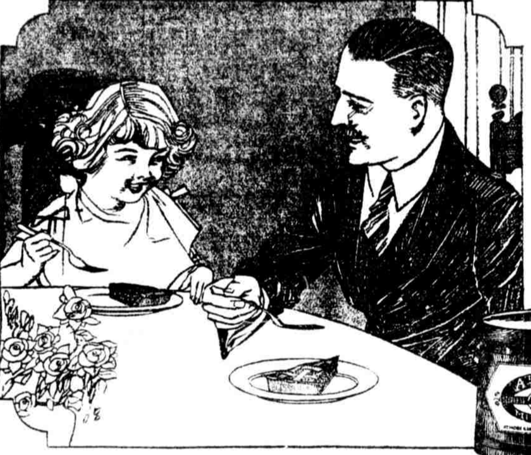
Also be sure to serve Atmore's Philadelphia Plum Pudding—"ready to heat and eat." Comes in individual tins for one or two persons and Family tin.