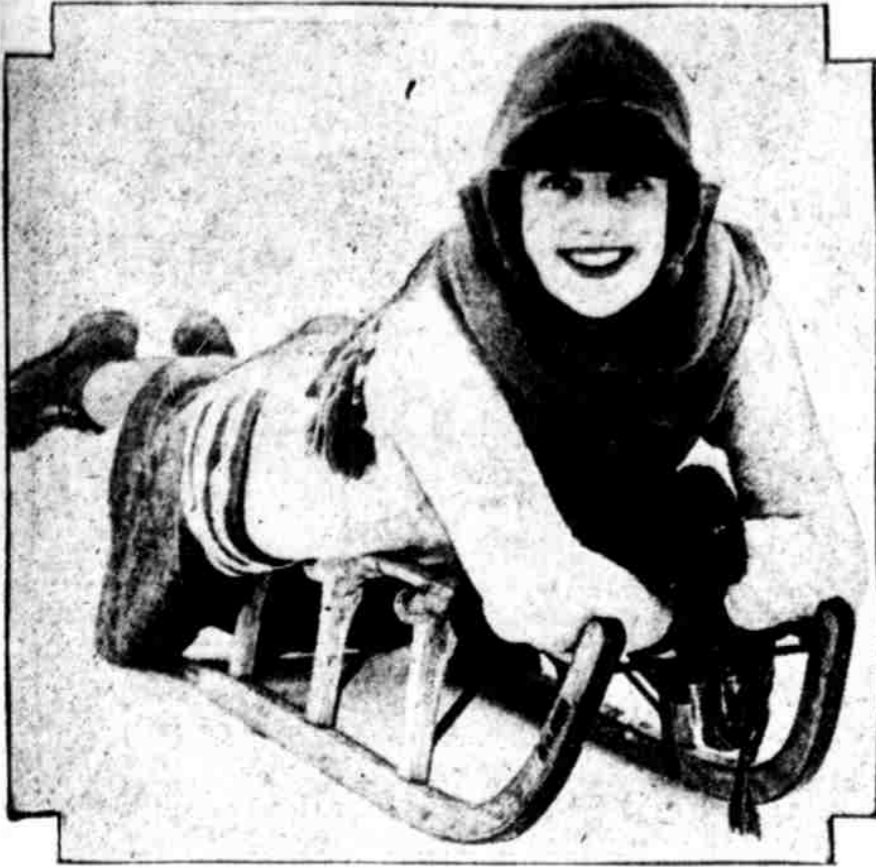
BEAUTY AND FASHION IN SWITZERLAND. Wouldn't you like to be enjoying the snow sport? Note the cozier is wearing an aviator's helmet. She's a Londoner.