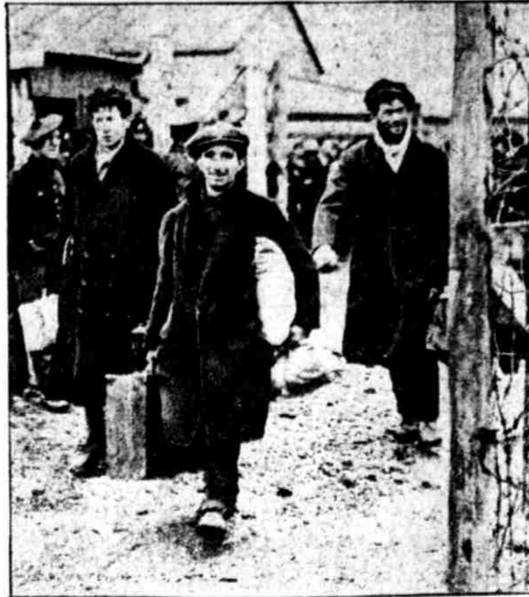
RELEASE OF IRISH POLITICAL PRISONERS. Some of the men as they left the barbed wire inclosure at Rath Camp, in Curragh, Ireland, under provisions of treaty Underwood & Underwood.