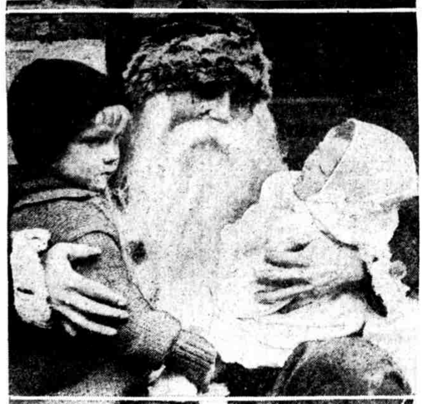
CITY NURSES TREAT DOWNTOWN CHILDREN. Their Santa Claus was very busy, as toys, food and things to wear were handed to children and mothers.