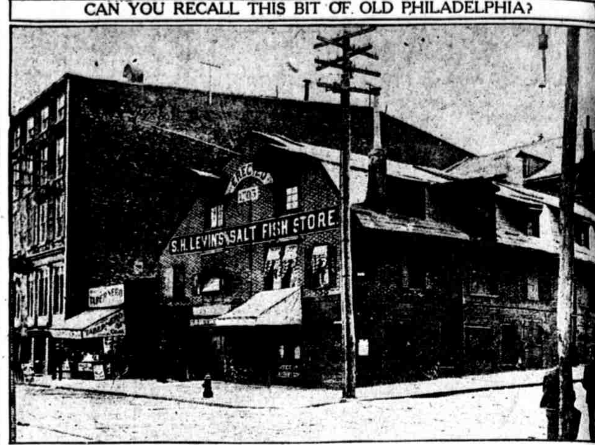
CAN YOU RECALL THIS BIT OF OLD PHILADELPHIA? THIS BUILDING IN USE NEARLY 200 YEARS. It stood at Delaware avenue and Race street, where the Philadelphia Fire Department's high-power station is now located, and was built in 1705. Not until 1901 was the structure torn down. Have you an old Philadelphia photograph? Send it to the EVENING PUBLIC LEDGER.