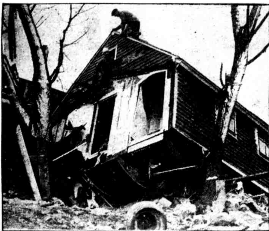
TREES CHECK FLIGHT OF BUFFALO DWELLING. One of the homes wrecked in the cyclone of Sunday morning. It was about the same time that Philadelphia and vicinity were hit by a storm of wind and rain.