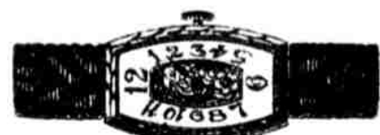
Bracelet watch of 18-karat white gold decorated border, fitted with dependable 16-jeweled movement—ribbon wristband—$45.

Every watch we sell must—and does—give satisfactory service. Our collection is extensive and includes the most fashionable shapes of the leading makers.