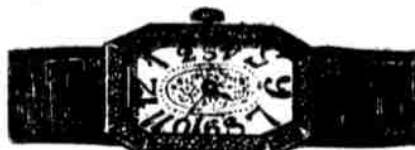
Bracelet watch of platinum, the border artistically set with diamonds; dependable movement—ribbon wristband—$210.