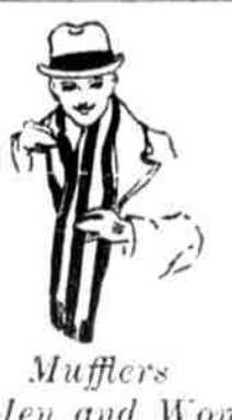
Mufflers for Men and Women

Clothes for the Winter golfer on Southern courses, squash and tennis rackets for Winter athletes, a fine assortment of golf clubs, bags and balls—including the Radio, the Mystery, the Diana, the Red Flash and the Blue Flash.