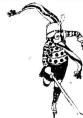
In the Sport Shop

Roomy, comfortable bath and lounging robes of lustrous silks and rich velvets in all colors.