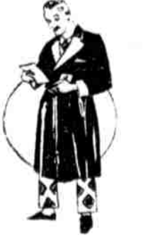
Lounging Robes for Men

Made-to-measure shirts of the finest quality madras, linen, and silks from France, Scotland and Japan.