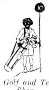
The Golf and Tennis Shop

Fishing tackle, guns from England's best makers, English croquet sets, lawn bowls, skis, ice skates, hockey sticks, revolvers, roller skates.