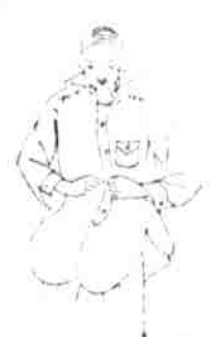
Shirts for Men

Carefully selected patterns of the finest silk, which are unusual; but conservative, also a fine variety of the new knitted ties.