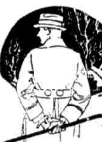
Walking Sticks and Canes

For Women—Hand-made woolen sweaters in the Jacquard patterns, Navajos, and Indian designs. Silk sweaters in plain or fancy weave come in all models and colors.