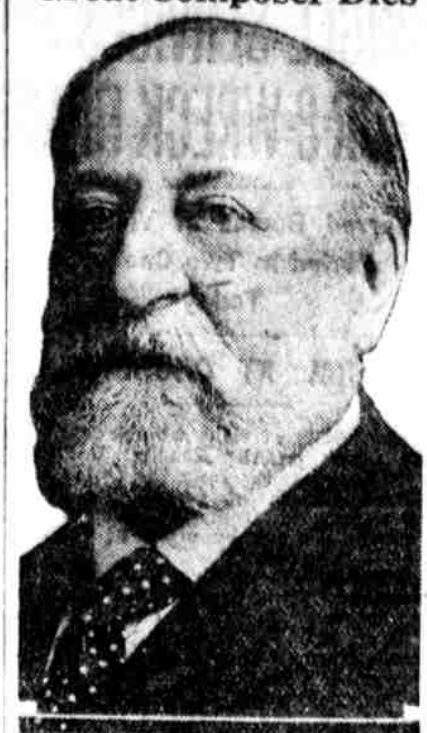
CAMILLE SAINT-SAENS Noted French musician who died suddenly yesterday in Algiers at the age of eighty-six

The Democrats lack the brains and ten 35,000-ton capital ships in the decnde 1925-35. the tentative agreement reached be- Lewis guns were used aga tween the Japanese and Chinese dele- ers by the Crown forces. gates in their Shanting conference of the city train service was shot dead, on the mode of financial settlement by China for purchase of the Kin Chow Railroad in the Japanese lease hold. With this obstacle removed, the persons were shot, William Proudfit, With this obstacle removed, the I negotiations at another meeting today,