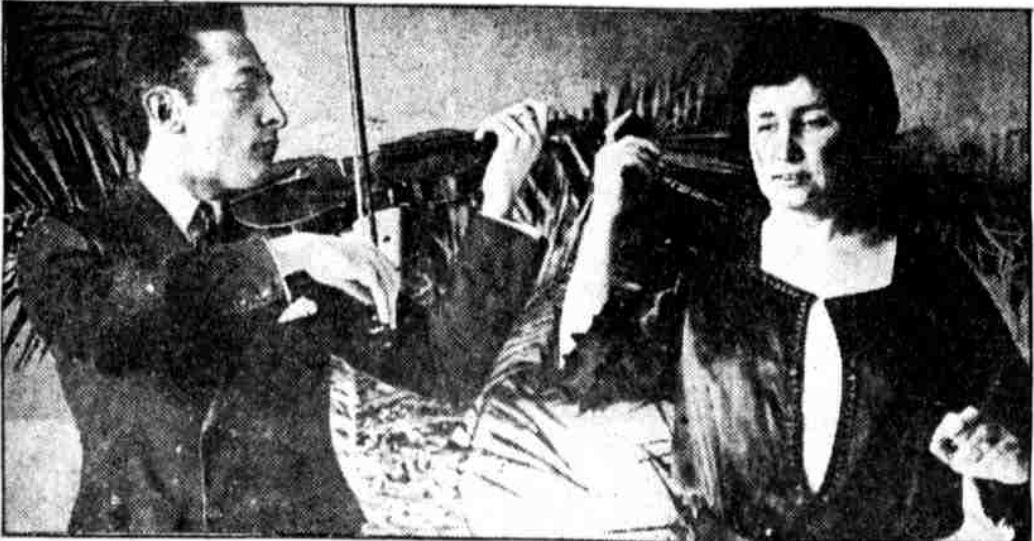
"LISTENING" TO VIOLIN. Helen Keller, the deaf and blind wonder girl, in Denver, places her hand on the violin and "hears" the music played by Jascha Heifetz through her finger tips.

LOOKING TOWARD NEW JERSEY FROM FOOT OF MARKET STREET. Thousands who travel on the Pennsylvania ferries to and from Camden little realize that an island was removed so that quick trips could be made across the Delaware. It was known as Windmill Island and was used as a picnic ground. Sheds in the foreground are on the site now used by the Market street ferry house. Have you a photograph of old Philadelphia? Send it to the EVENING PUBLIC LEDGER.