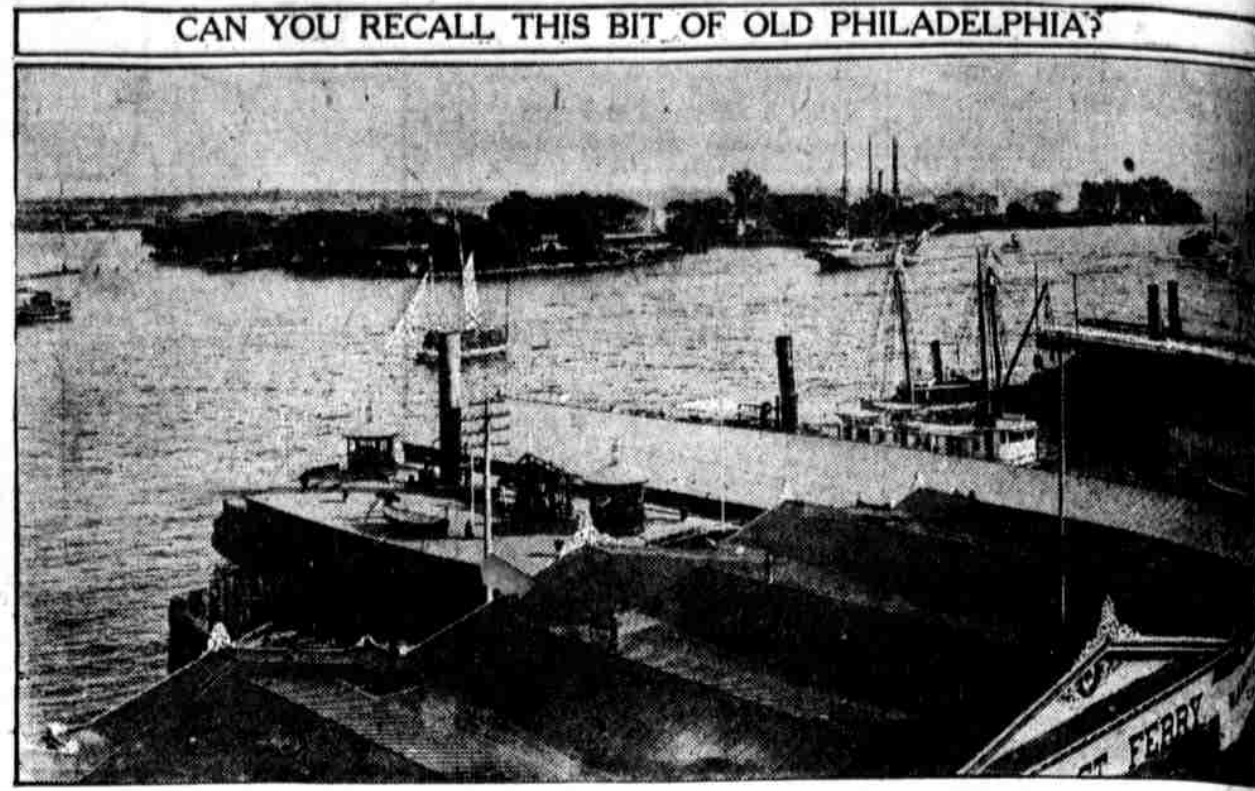
CAN YOU RECALL THIS BIT OF OLD PHILADELPHIA?

LOOKING TOWARD NEW JERSEY FROM FOOT OF MARKET STREET. Thousands who travel on the Pennsylvania ferries to and from Camden little realize that an island was removed so that quick trips could be made across the Delaware. It was known as Windmill Island and was used as a picnic ground. Sheds in the foreground are on the site now used by the Market street ferry house. Have you a photograph of old Philadelphia? Send it to the EVENING PUBLIC LEDGER.