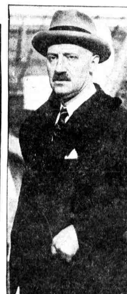
SAILING TO EUROPE. Bainbridge Colby, former Secretary of State, on the Olympia.