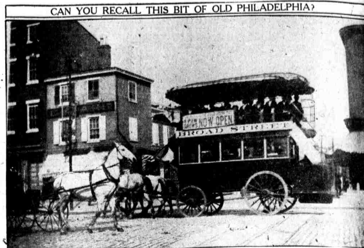
CAN YOU RECALL THIS BIT OF OLD PHILADELPHIA?