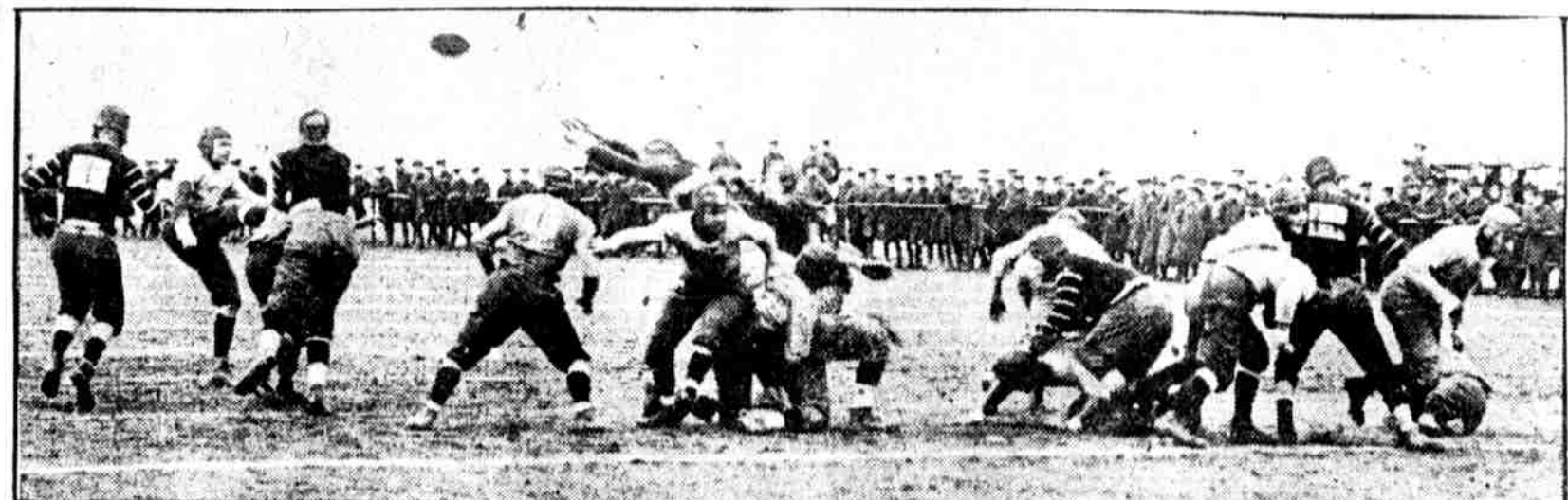
AN OVERSEAS BATTLE. The American soldiery now looking after the interests of this country on the Rhine do a lot of athletic work to keep fit. Football is holding the stage of sports activity. The camera clicked as the Fifth Infantry was making gains against the strong line of the Eighth Infantry, near Coblenz, a few weeks ago.