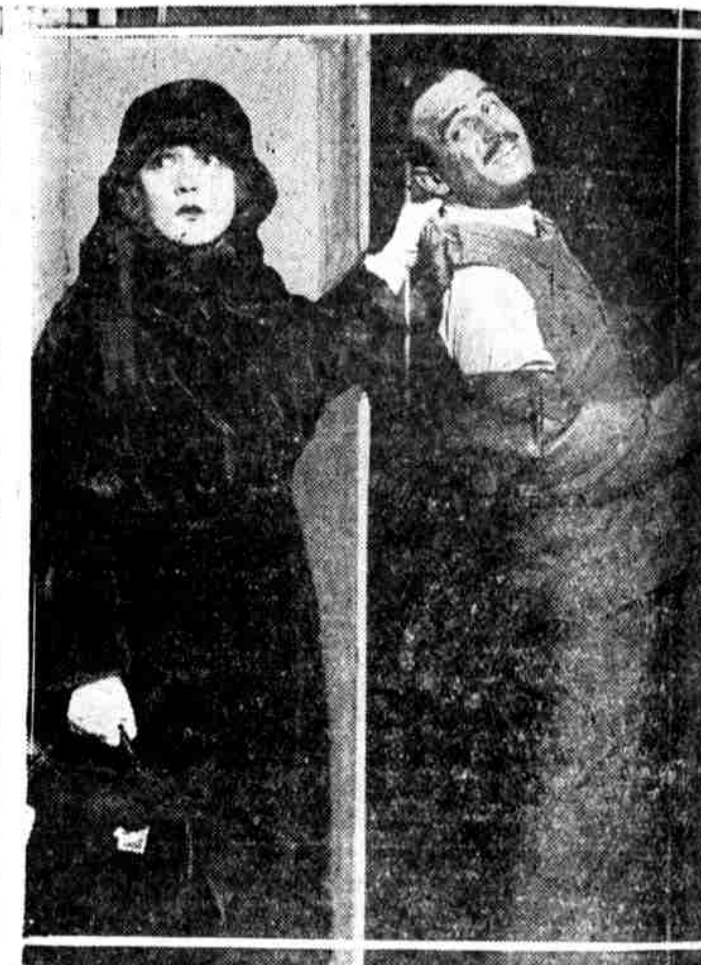
"HURRY UP, 'DOUG'!" Mary Pickford is seen pulling at "Doug" Fairbanks' coat, as she hurries to get ashore from the steamship Paris, on arrival in New York.