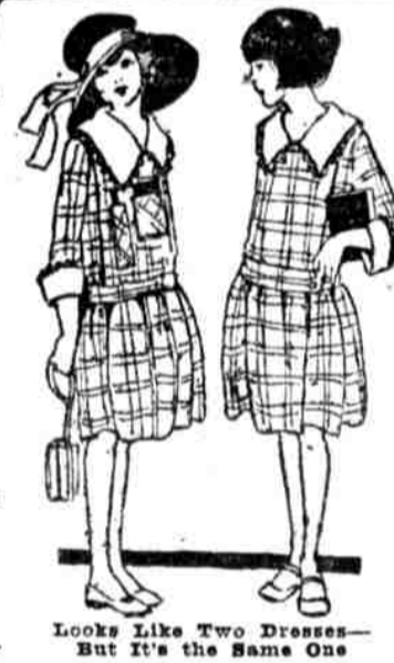
Looks Like Two Dresses—But It's the Same One

Ginghams—beautifully plaided; splendidly made. Each has pockets filled with ruler, pencil, rubber, and the cutest paper-tablet you ever saw. Sizes for ages 6 to 14. Holly-boxed for Christmas giving. —Gimbels, Subway Store.