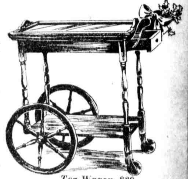
Tea Wagon, $20

In the building of tea wagons this is regarded as a distinct achievement, considering its price.